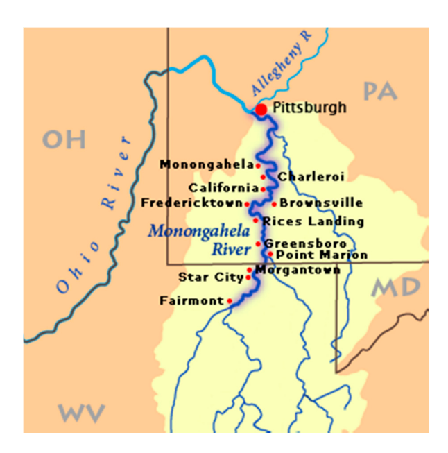
Figure 1. The "River Towns" of the Monongahela River.

despite the intervention of numerous regional economic revitalization programs funded by the federal and state governments.