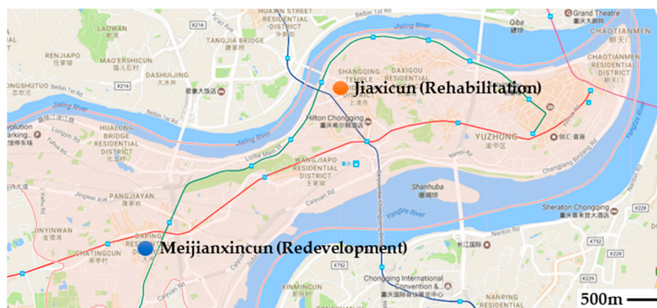
Figure 1. Map of two case projects in Yuzhong District, Chongqing, China.

surrounding environment, with many old and dilapidated residential buildings built from the 1970s to 1990s. It is a typical project, with a median size (around 19,000 m 2 ), median household number (1100 potentially affected residents), and most of the residents are vulnerable groups.