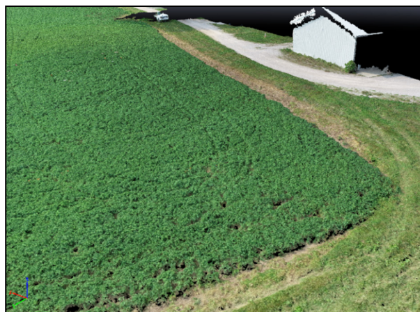
Figure 4. An isometric top view of a portion of a fully processed alfalfa model of field 1 flown on 4 June 2019 using 30–90° flight parameters. Only part of the nearby barn is modeled as the flights only recorded one side of the building.

The values in Table 4 precisely describe the detail of the models, but images of the models are also useful in understanding the model detail. Examples of a section of the model created using the images captured with the 30–90° flight parameters on 4 June 2019 in Field 1 are shown in Figures 4–6. The images show that the models captured gaps in canopy coverage and details such as the wheeled traffic effects from a spray application two weeks prior.