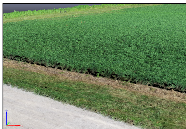
Figure 5. A side view of the alfalfa canopy in Field 1 from a portion of a fully processed model flown on 4 June 2019 using 30–90° flight parameters. Although the UAV did not take pictures from this angle and this close to the ground, the photogrammetry process captured the transition from the short grass bordering the field to the taller alfalfa plants.