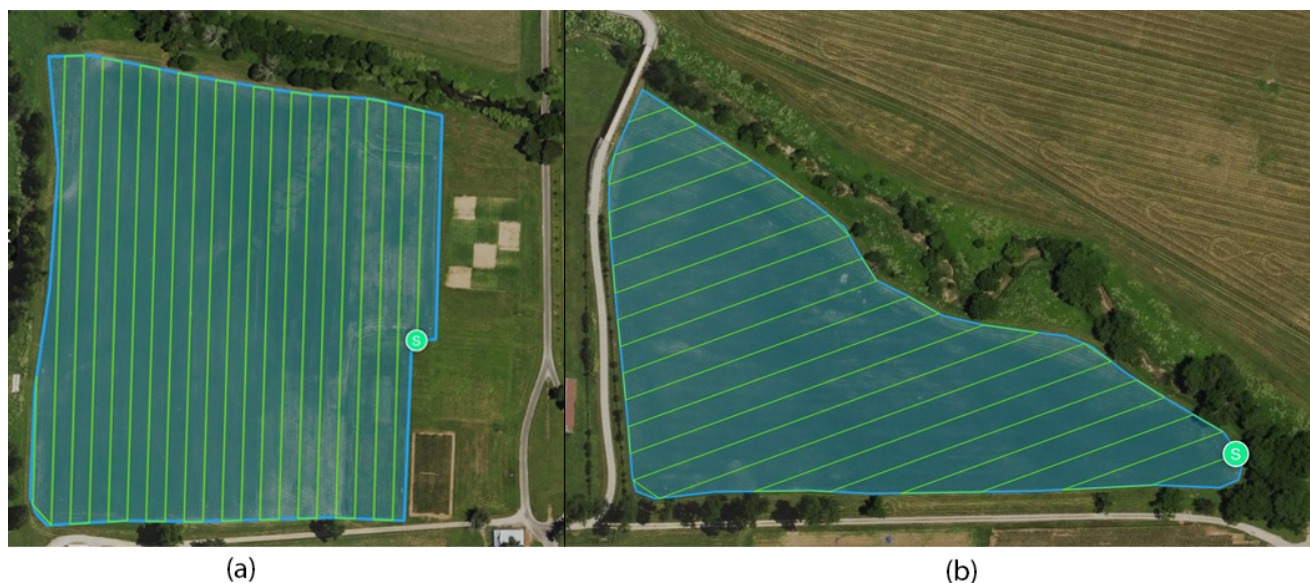
Figure 2. Field 1 (a) and Field 2 (b) outlined in blue. The green lines show the UAV path when following a mission to cover the entire field. The “S” indicates the starting point of the mission.

on 21 May 2019. Weed, insect, and disease pressure were manually evaluated at 10 points (1 m 2 sampling quadrats) in each field on each of the four separate data collection days. After performing the drone flights on each day, the alfalfa in each sampling quadrat was hand harvested, weighed, and dried to determine the dry matter yield for each quadrat.