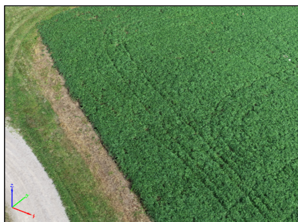
Figure 6. An aerial view of the alfalfa canopy in field 1 and tracks from wheeled traffic on a portion of a fully processed model flown on 4 June 2019 using 30–90° flight parameters.

The results from the individual models were compiled by flight parameters used in the flight to capture the model data (Table 5). The largest effect of the flight parameters was on the GSD. The flights at an altitude of 30 m had a much lower mean Model GSD compared to the flights at 50 m, as would be expected with models based on images taken at different altitudes. This corresponds to finer detail in the models from the flights at 30 m. There was also little variation (low standard deviation) in the GSD between models created using a given flight parameter. For all models created using the 30–90° flight parameters, the GSD was always less than 1 cm. For models created using 50–75° and 50–90° flight parameters, the GSD was always below 1.5 cm.