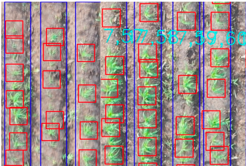
Figure S2. The measurement system removes the influence of weeds outside the row through the detection of maize rows.