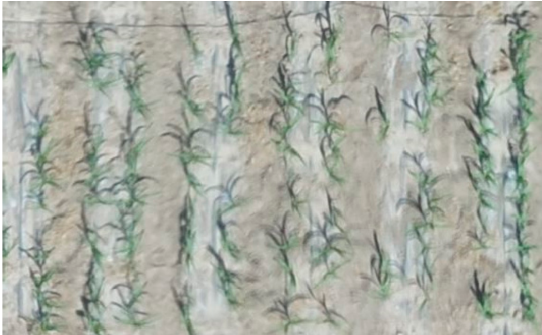
Figure S1. Aerial image of maize seedlings at Zhangye Experimental Station in 2022.