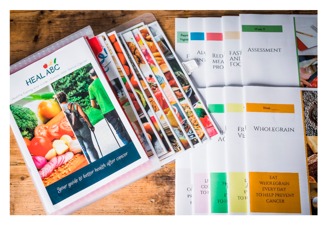
Figure 2. Healthy-Eating and Active Lifestyle After Bowel Cancer (HEAL ABC) resource.