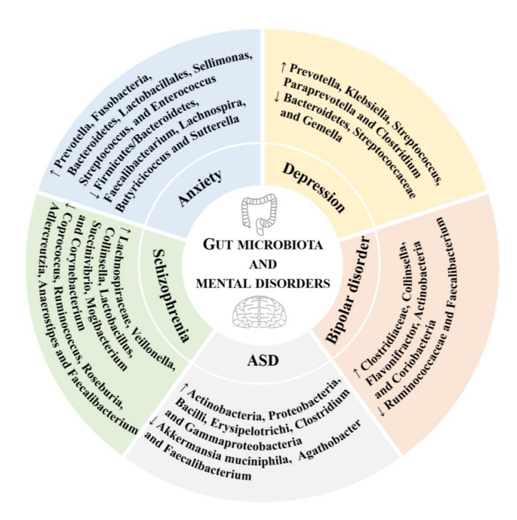
Figure 1. The relationships of gut microbiota and mental disorders. \uparrow represents positive association, \downarrow represents negative association. ASD, autism spectrum disorder.