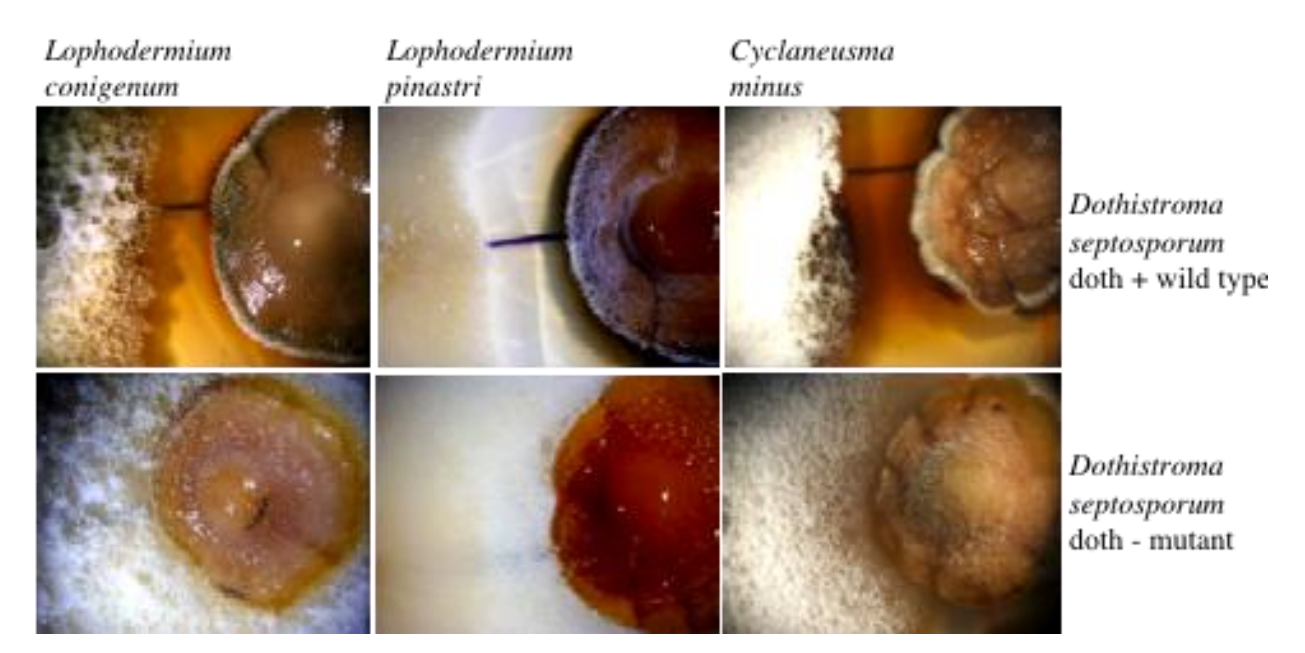
Figure 3. Growth of forest fungi L. conigenum , L. pinastri and C. minus (left colony in each picture) was inhibited in a plate competition assay by dothistromin-producing D. septosporum wild type (right hand colony, top row) but not by a dothistromin-deficient strain (NZE7, \Delta pksA ; right hand colony, bottom row). Photographs were taken at the same time points for corresponding doth+ and doth- plates.

The arrangement of these genes—whether they are also in mini-clusters and whether they are on the same 1.3 Mb chromosome—will be of considerable interest and may enable important questions about the evolution of gene clusters to be addressed. The fragmentation seen in D. septosporum compared to the clustering of orthologous genes in Aspergillus species may help to determine an 'ancestral' cluster and to propose mechanisms that led to the gene arrangements seen today. Another question that can be addressed pertains to why the ability to produce specific mycotoxins is so variable between even closely related species. The Dothideomycete class of fungi clearly contain some orthologs of ST/AF/dothistromin genes yet only a handful of them produce these compounds. On a narrower phylogenetic scale, the arrangement of dothistromin genes can be compared with that of the pine pathogen species Dothistroma pini . Furthermore it will be possible to determine if there are intraspecific differences between the New Zealand D. septosporum strain sequenced by the JGI and current epidemic strains of D. septosporum in Canada and Europe.