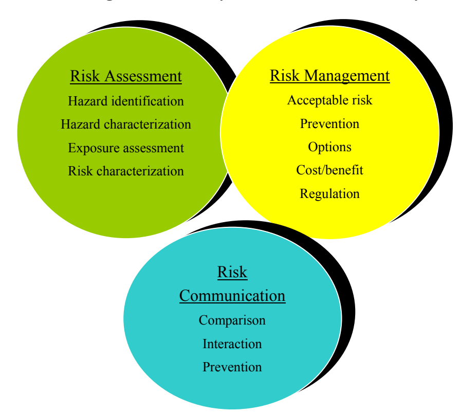
Figure 1. Risk analysis framework for food safety.

and G<sub>2</sub>; AFM<sub>1</sub>; OTA; patulin; FB<sub>1</sub>, FB<sub>2</sub>, and FB<sub>3</sub>, ZEA, T-2, HT-2 toxins and DON), the Joint Expert Committee on Food Additives (JECFA-Scientific Advisory Body of the World Health Organization WHO) and the Food and Agriculture Organization (FAO) has evaluated their hazard in several sessions [83–85]. In February 2001, a special JECFA session was devoted to emergency mycotoxins. Two reports have appeared following this session: a longer version [86] and a shorter version [87]. These reports provide good and detailed insight into the process of risk assessment of mycotoxins. The reports addressed several concerns about the mycotoxins considered - their properties and metabolism, toxicological studies, and final risk evaluation. With the mycotoxin evaluations, the Committee discussed general considerations on sampling, analytical methods associated intake issues and control. Risks associated with mycotoxins depend on both hazard and exposure. The hazard of mycotoxins to individuals is probably, more or less, the same all over the world (although other factors are, sometimes, also important, e.g., hepatitis B virus infection in relation to the hazard of aflatoxins). Exposure is not the same due to different levels of contamination and dietary habits in various parts of the world. The risk analysis framework for food safety is illustrated in Figure 1.