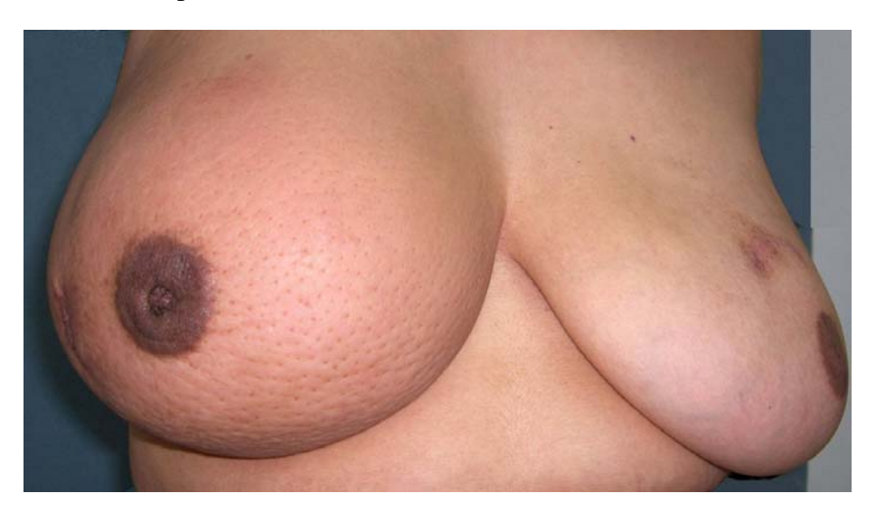
Figure 1. Clinical photo of IBC patient. Inflammatory breast cancer of the right breast characterized by marked edema and swelling, erythema and dimpling ("peau d'orange") characteristic of the patients meeting the AJCC case definition.