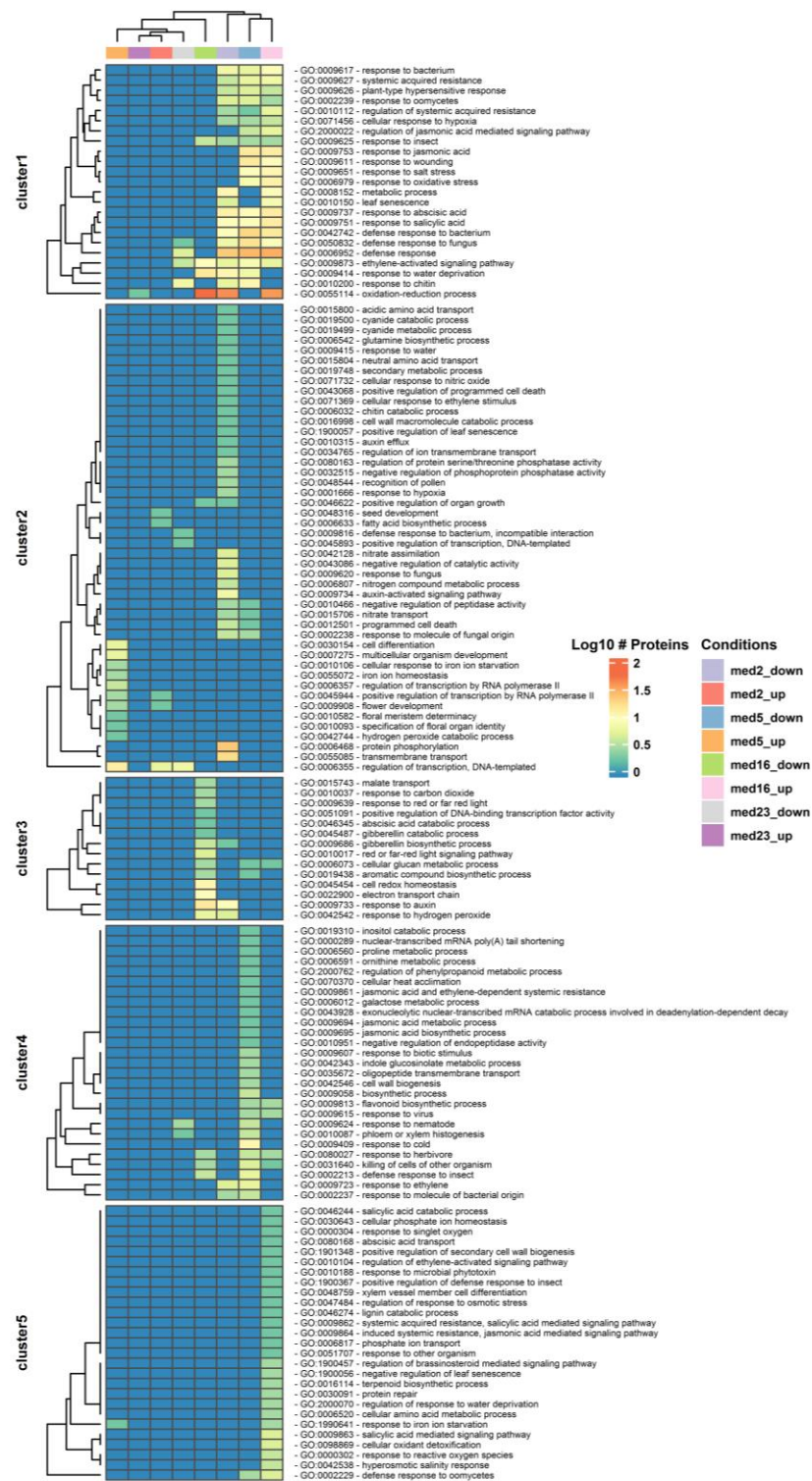
Supplementary Figure S3: 137 unique GO terms detected with NeVOmics in the four conditions of Case study 2. These data are represented in a clustered heatmap that includes all up- or down-regulated identified gene products.