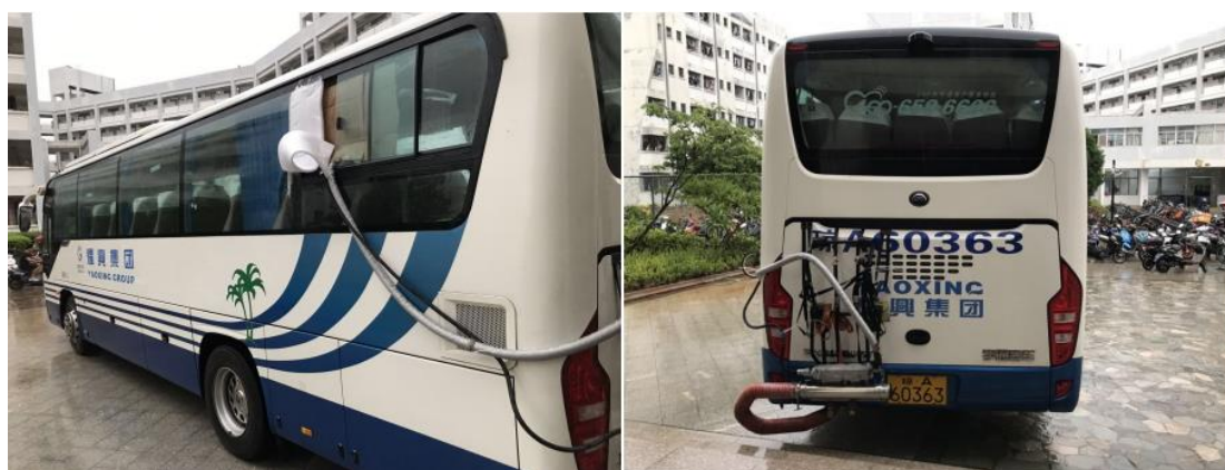
Figure S3. Portable emission measurement system installation and location.