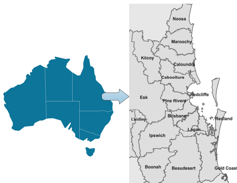
Figure 3. Case study areas in South east Queensland: Map of the location of the 4 LGA that were used in the rainwater tank saving study from 2008 to 2012 ( https://www.emerald.com/insight/content/doi/10.1108/02637470410570752/full/html ).

Four local government authorities (LGA) (Caboolture, Pine Rivers, Redlands and Gold Coast) were selected as the case study areas in South East Queensland (SEQ), as shown in Figure 3. Caboolture and Pine Rivers were amalgamated into Moreton Bay Regional Council in 2012. These areas were selected due to their high annual growth rate (from 4.5% to 4.9%) and population numbers, resulting in growing water demands. The councils also had datasets with levels of reliable information that could be used (with permission) to extract consumption data for the required timeframes. The houses constructed post-2007 had rainwater that was plumbed to toilet(s), laundry cold water taps and external taps for garden supply [22,23].