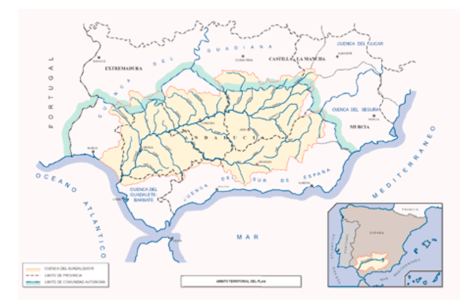
Figure 1. Guadalquivir River Basin District.

It covers an area of 57,679 km<sup>2</sup> and contains a population of 4.3 million. The basin has a Mediterranean climate with a heterogeneous distribution of precipitation. The annual average temperature is 16.8 °C, and the annual average precipitation is 573 mm, with a range between 260 mm and 983 mm (standard deviation of 161 mm). The main land uses in the basin are forestry (49.1%), agriculture (47.2%), urban areas (1.9%), and wetlands (1.8%) [13] (Figure 1).