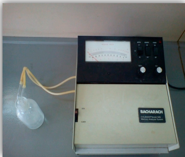
Figure S1. Bacharach cold vapor mercury analyzer system (Coleman-Model 50B).