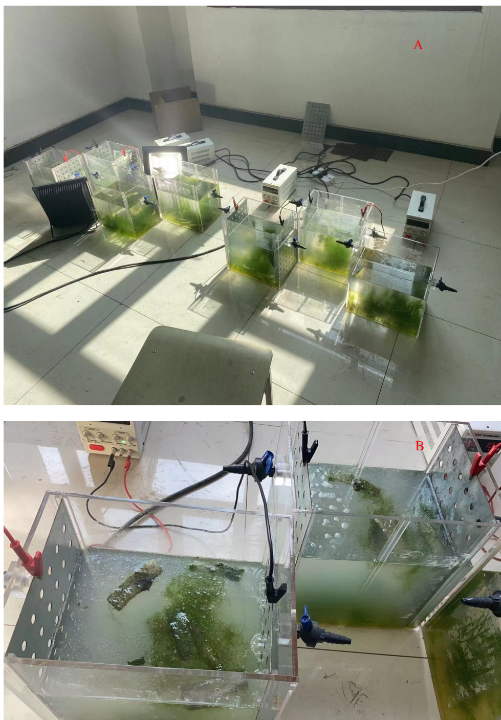
Figure S1. Experimental device in the experiment (Part). Note, one group for the electricity addition device for the periphyton (A); and the detailed device description image (B).