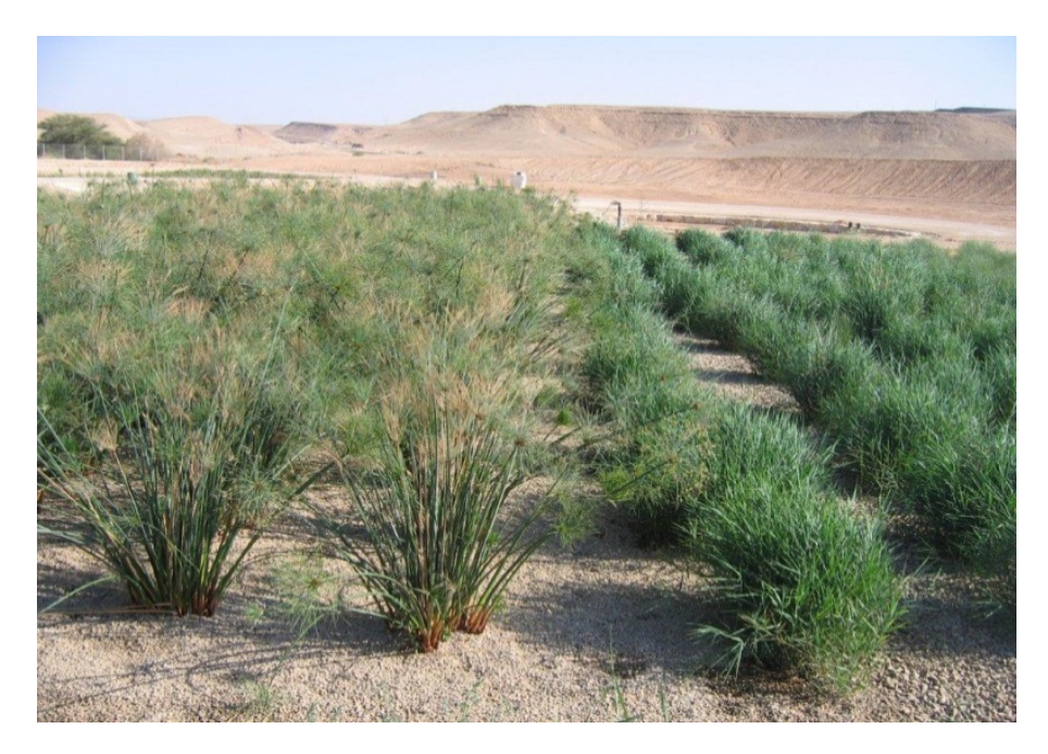
Figure 2. Submerged plant rows in the studied constructed wetland, Kibbutz Neot Smadar, Israel.

Analyzing H<sub>2</sub>O<sub>2</sub> levels in plants in beds A and B along the wetland water flow demonstrated a 75% reduction in the downstream direction (Figure 3). The improvement in this physiological parameter was correlated to decreases in biochemical oxygen demand (BOD), chemical oxygen demand (COD), total suspended solids (TSS), total ammonia N, total N, and Escherichia coli as measured over the years in the CW ([45,46], Figure 3). This observation, together with previous ones, showed that water quality in the studied wetland [46] is correlated with photochemical efficiency (Fv/Fm), net photosynthesis assimilation, and cell membrane stability. This supported our hypothesis that plant