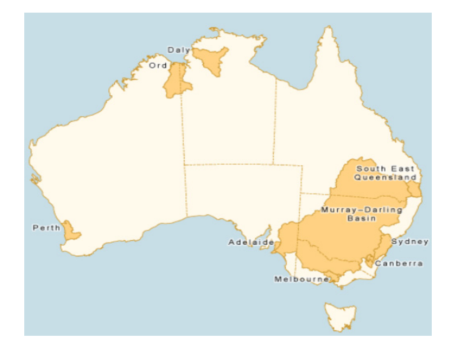
Figure 1. Coverage of National Water Account, 2013. Source: [29].

The above progress by the BOM amounts to a massive step forward in terms of information availability and transparency compared with a decade ago. However, the job is not complete. Areas where less or little progress has been achieved include water quality and water prices, and some remaining definitional issues in key data series between national and state agencies, and even between national agencies. These issues are discussed below.