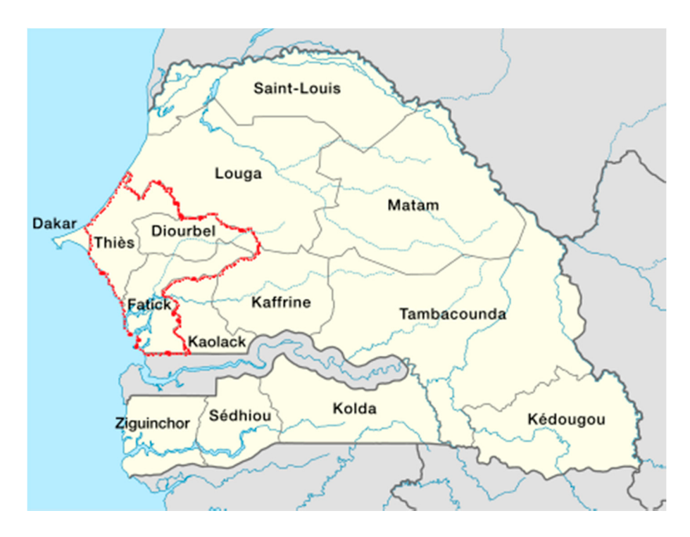
Figure 1. The three studied regions.

the project was developed in these central regions of Senegal (part of the so-called Bassin Arachidier and it was primarily focused on the improvement of the local horticultural production, for the final selection of 70 horticultural perimeters (each of them ranging from 5 to 10 hectares for a total of around 400 hectares) among the initial 144. A gender analysis of such horticultural component thus seemed the most interesting since, in Senegal, this sector (generally intended to export operations) mostly involves women even if especially as farm hands [57]. The project intended to apply a "communal system" of the cultivated land (in which the implication of farmer organizations is strongly fostered, as already mentioned before), using a common water source to irrigate all the plots of the horticultural perimeter. In practice, the whole perimeter was divided into individual plots, with several management committees (mainly composed of men) entitled to take decisions about the perimeter management.