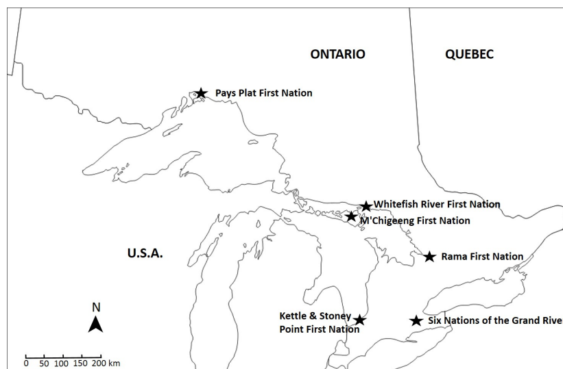
Figure 2. Location of the First Nations communities in Ontario discussed in this report.