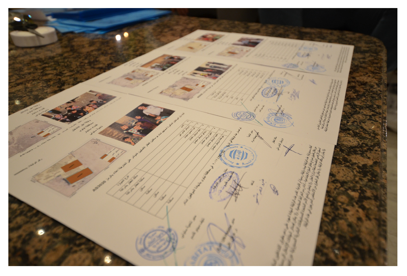
Figure 3. Certificate of occupancy for Yazidi village [33], (p. 62); copyright UN-Habitat.

Thirdly, there is likely to be large-scale ambiguity and gaps in the land-related regulatory framework [29] (p. 671), [21] (p. 246), [19] (p. 7). Some of the cases demonstrate this ambiguity and fluidity of the land-related institutional landscape. In Iraq, the extra-legal LAS created by UN-Habitat became politicized when the Iraq Federal Government army took back the area from the Kurdish state government control in 2018. For a while, it was unclear as to whether the extra-legal LAS and its land certificates (see Figure 3 below) that UN-Habitat and the local government had put in place for Yazidi returnees were going to be accepted by the national government. They were accepted by the Prime Minister's office and is in the process of being extended to the whole of the Governorate of Ninewah [36] (pp. 73–74). The ambiguity and gaps in the land-related regulatory framework, be it through the statutory, customary or religious systems, undermine the weak land right claims of women [19] (p. 71). In Jubaland/Somalia, there has been forty years of civil war. The LAS was only embryonically developed when the state collapsed and the decades-long civil war has added further challenges for the formal, legal and institutional LAS. LA functions are undertaken by a mixture of practices inspired by religious, customary and statutory laws, with the last based on laws that existed before the current federal nature of Somalia was set up [9] (pp. 26, 32–37).