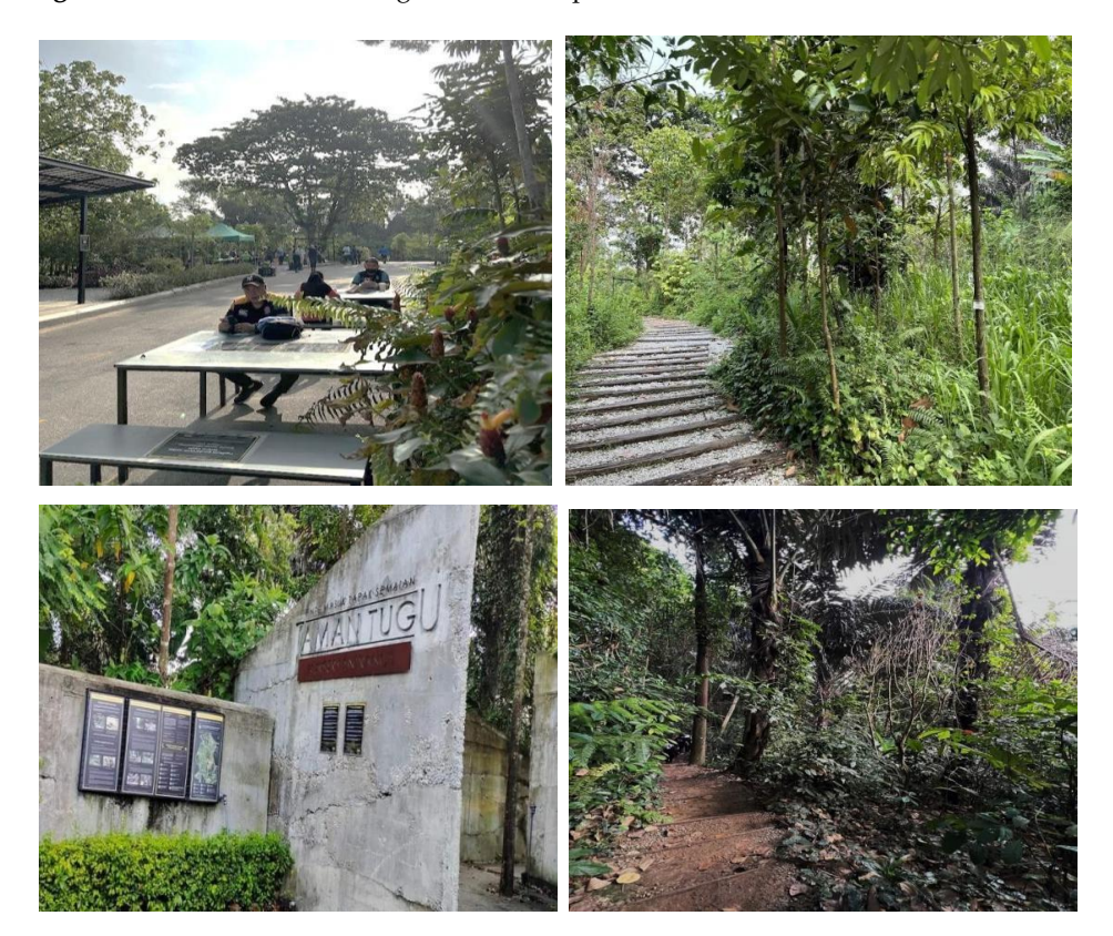
Figure 2. Photos of Taman Tugu (left), Kuala Lumpur (right).