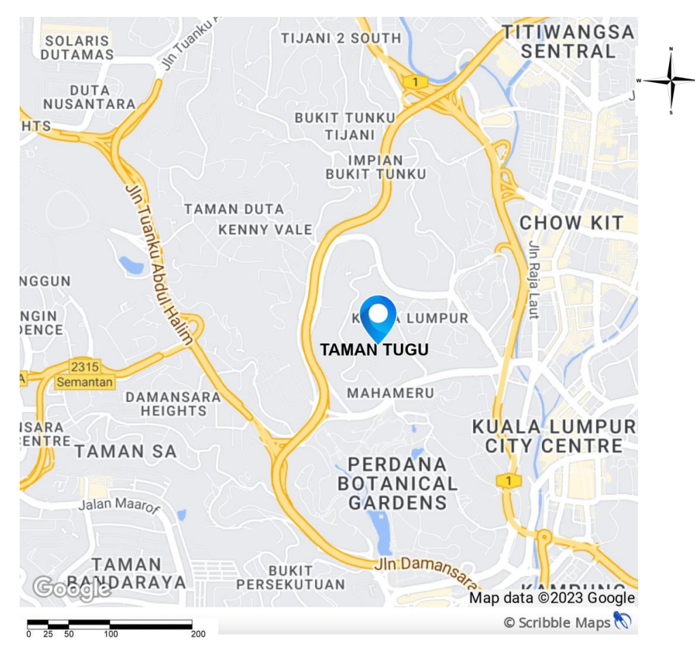
Figure 1. Location of Taman Tugu, Kuala Lumpur.