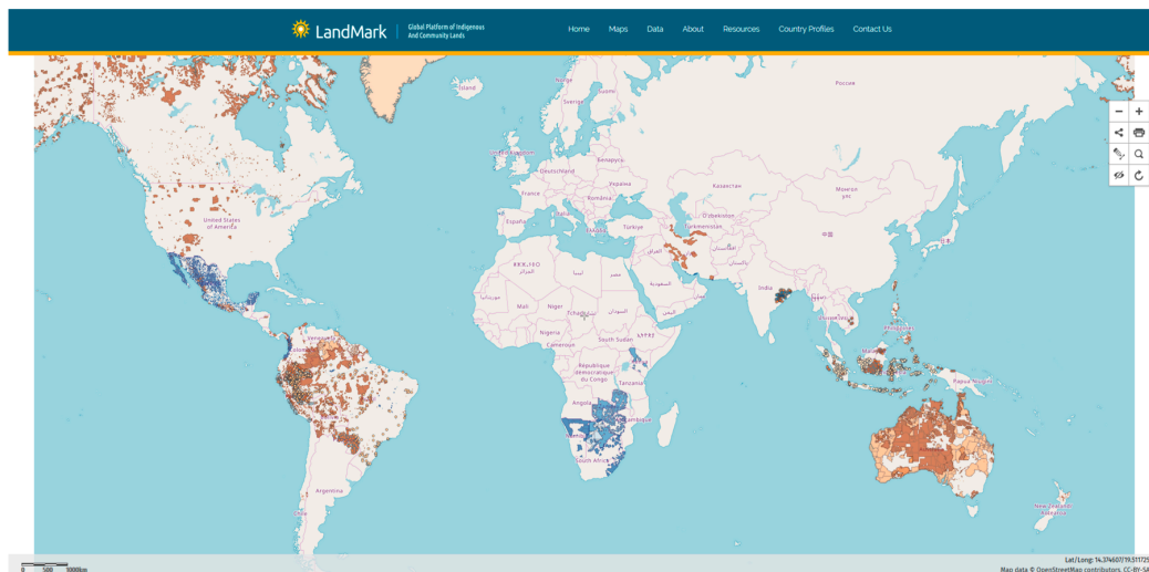
Figure 2. Partial Progress in Mapping and Recognizing Community and Indigenous Peoples Lands (2017). Note: Brown refers to Indigenous Peoples lands. Blue refers to lands of other communities. Dark brown and dark blue means these lands are registered or otherwise legally acknowledged. Light brown and light blue mean these mapped lands are not yet formalized, on a case-by-case basis. Blank means no data; millions of hectares of unidentified community lands exist in many countries, and where no mapping has yet been conducted.