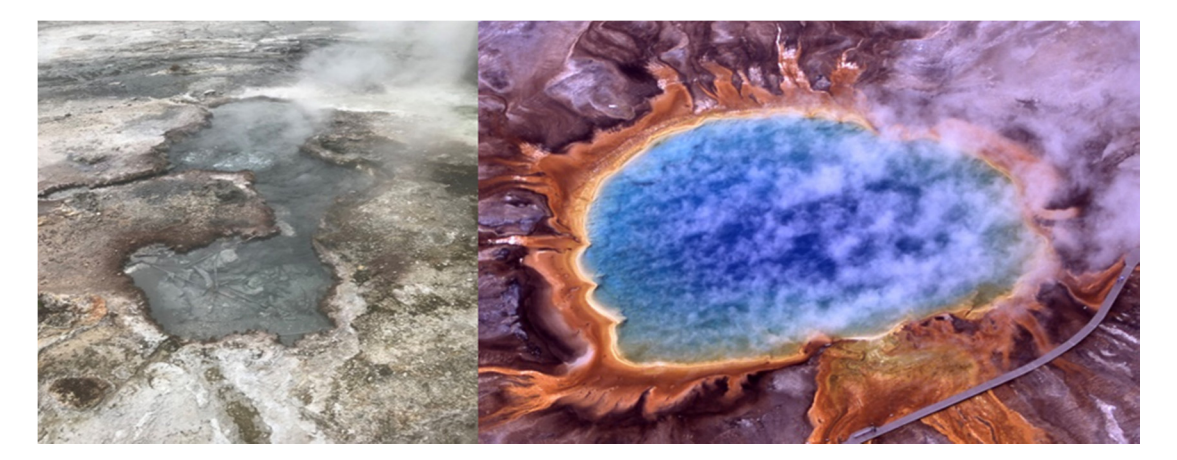
Figure 1. Hydrothermal fields on dry land. ( Left ) Orakei Korako. Upwelling Pool with discharge channel on sinter apron, near Rotorua New Zealand. ( Right ) Grand Prismatic Hot Spring, Mid/Lower Geyser Basin at Yellowstone National Park.