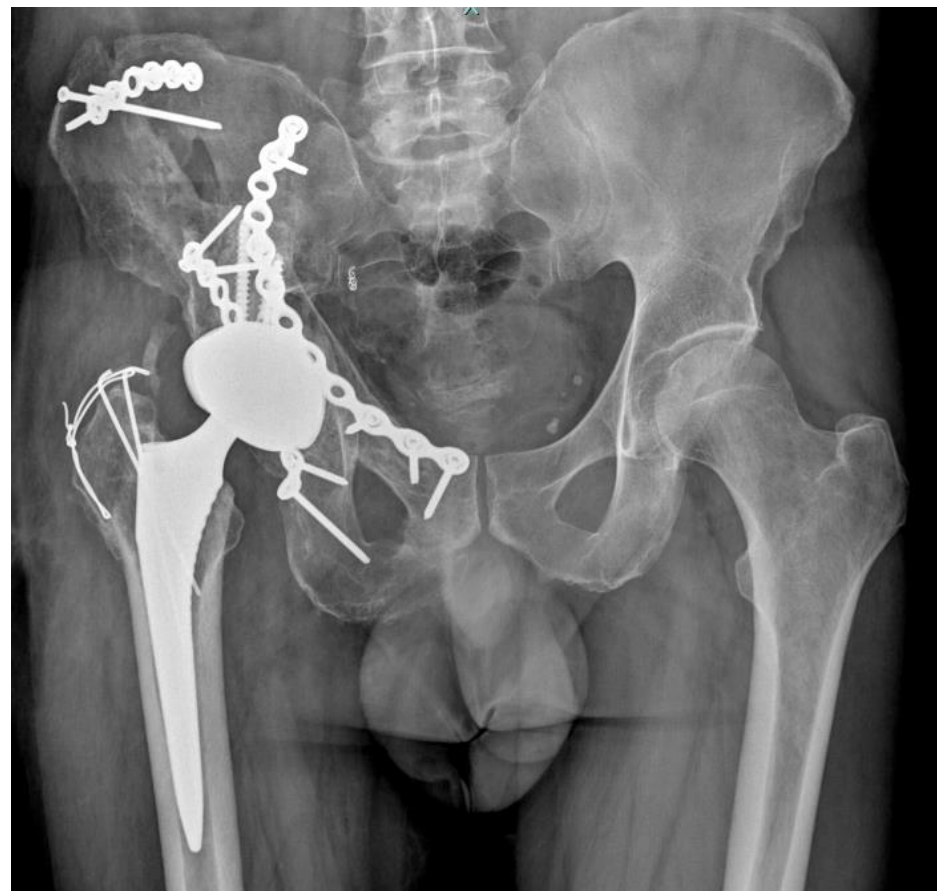
Figure 5. X-ray of the pelvis after the implant of total hip arthroplasty.