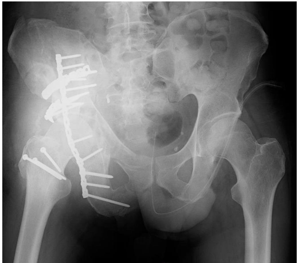
Figure 1. X-ray of the pelvis and hip when the patient came to our attention.

A 51-year-old man was involved in a high-impact trauma (motor vehicle accident) with a right bicolunar acetabular fracture, according to the Letournel classification. He also had a concomitant left humeral shaft fracture, left pneumothorax, head injury, and liver contusions. He was initially admitted to the intensive care unit of another hospital. When he was stabilized, he was admitted into the orthopaedics department of the same hospital he was admitted. Thus, he was treated with open reduction and internal fixation (ORIF) with plates and screws in both fractures (Figure 1).