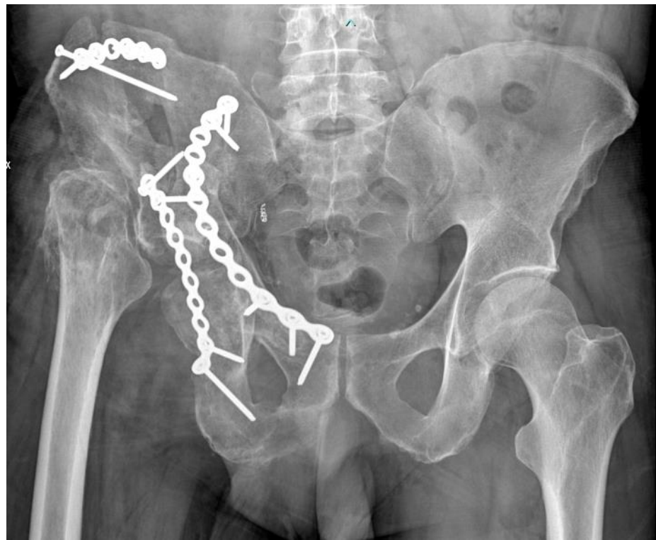
Figure 4. X-ray of the pelvis after the new osteosynthesis of the bicolumnar acetabular fracture.