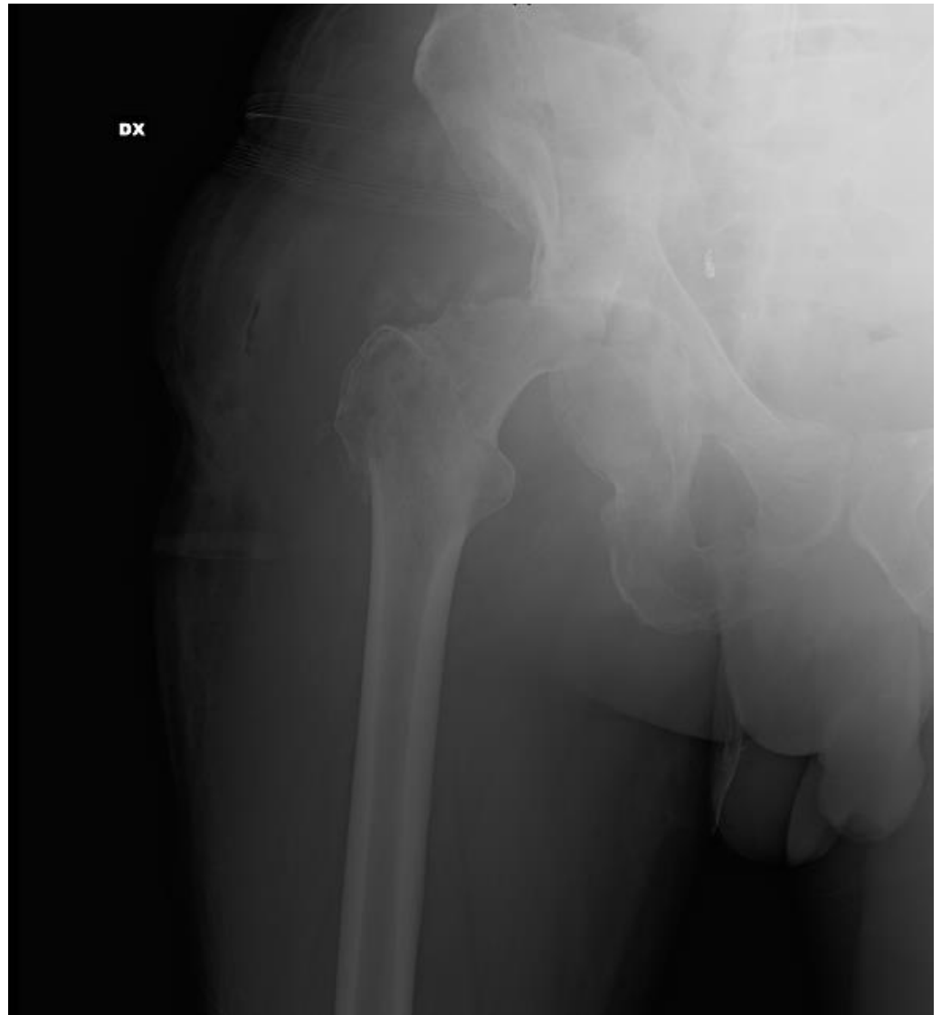
Figure 2. X-ray of the pelvis after the implant removal.

new osteosynthesis and implant a total hip arthroplasty (THA). In the first stage, we started to perform fistulotomy, then continued with implant removal (plates and screws) from the acetabulum. During the removal of implanted devices, irrigation (about 10–12 L of saline solution) and accurate and aggressive debridement were performed (Figure 2).