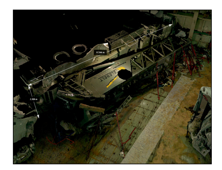
Figure 1. 3D analyses of the CSI.

A 35-year-old man was found dead inside a "car carrier" depot on a cargo ship during an inspection on a flooded deck during a storm. The CSI was conducted through the LS that fixed the scene through a series of scans with an accuracy of 6 mm at 10 m. An inspection was performed of the truck that was damaged at the front and sides. An external examination of the cadaver was also performed. The presence of fractures at various body sites, excoriations, hematomas, and contusions was found. There was a perfect correspondence between the injuries found on the body and the impact against a solid and rigid surface of the truck. Thanks to the use of the LS, it was possible to have a complete reconstruction of the CSI (Figure 1).