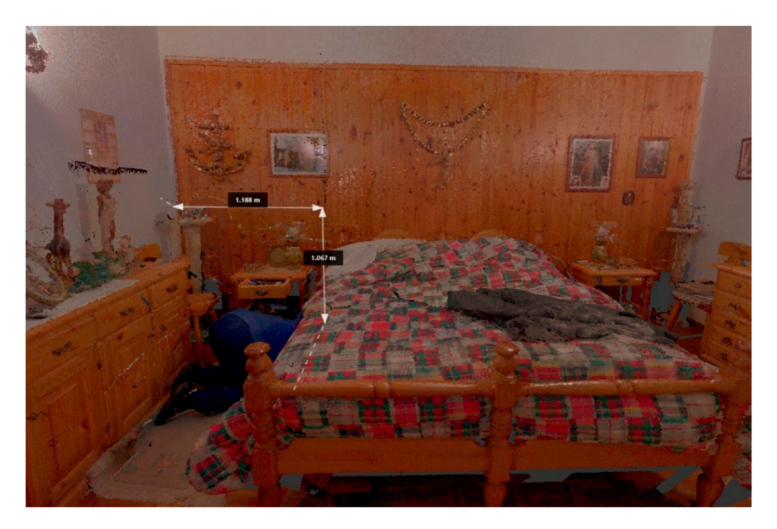
Figure 4. Case 4—3D reconstruction/measurements and position of the body.

present in the room. Thanks to the use of the LS at the crime scene and a thorough external examination performed by the forensic staff, it was concluded that the death was due to a suicide (Figure 4).