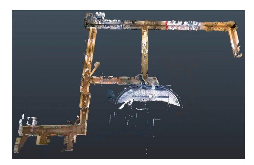
Figure 5. Case 5—3D reconstruction of the central block of the Hospital.

The forensic staff was involved in the reorganization of a Sicilian hospital during the COVID-19 pandemic, to plan the pathways of the healthcare personnel within the COVID-19 and non-COVID-19 areas of the hospital. Prior to the inspection, all personnel wore personal protective equipment (PPE) as per guidelines [18–20]. The staff proceeded with the analysis of the internal and external environments through the use of the LS, which made it possible to study and reorganize all the pathways of the COVID-19 areas, with the analysis of the PPE dressing areas of the healthcare personnel, the PPE removal areas, disinfection areas, and exit areas where healthcare personnel were "clean" (Figure 5).