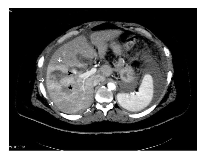
Figure 4. Patient with liver lesion in segment 5, 6, 7 and 8. PS/AF is seen within the lesion and THAD around the lesion. One observer missed the PS/AF. The liver lesion is marked with a black star, the areas with THAD are marked with white arrows and the pseudoaneurysm is marked with a black arrowhead.

Figure 3. Patient with liver lesion in segment 5, 6, 7 and 8. THAD is seen in the periphery of the lesion and pseudoaneurysm and arteriovenous fistula (PS/AF) is not present according to the gold standard. However, one observer suspected a pseudoaneurysm, which is marked with a black arrowhead. The liver lesion is marked with a black star and the areas with THAD are marked with white arrows.