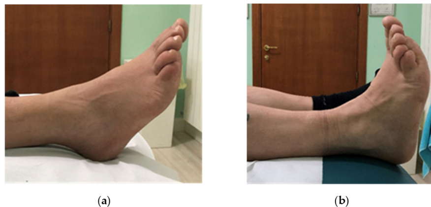
Figure 2. Foot drop. Active ankle dorsiflexion before (a,b) after surgical and rehabilitation treatment.