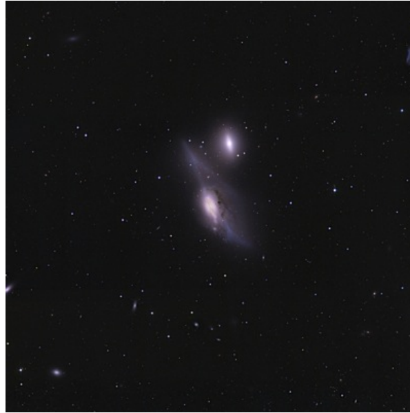
Figure 1. False-colour image of the galaxy NGC 4438, one of our sample galaxies classified as Class B in [13]—recognising its highly distorted morphology indicative of the galaxy undergoing an interaction.