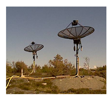
Figure 1. The 2.3 m radio telescopes of the Onsala Space Observatory.

The data processing and analysis was done using the SalsaSpectrum software<sup>2</sup>. Unfortunately, the data obtained with the 2.3 m radio telescopes are not flux calibrated. To carry out this process, we observed several positions toward the galactic plane. Then, the obtained HI 21-cm spectra were compared with calibrated spectra of the same galactic positions previously observed (Higgs and Tapping [5]), obtaining in this way a flux calibration factor. The calibration observations were carried out toward four positions: l = 74^{\circ} , b = 1^{\circ} ; l = 119^{\circ} , b = -1^{\circ} ; l = 131.2^{\circ} , b = 1^{\circ} ; and l = 140^{\circ} , b = -3^{\circ} . The intensity of our calibrated spectra is given in brightness temperature ( T_B^* ). We noted that the HI 21-cm line intensities—observed toward the calibration positions—did not change by more than 20% as the integration time varied from 20 s to 160 s; therefore, our spectra are affected by 20% uncertainties in the intensity. We used an integration time of 20 s to observe the calibration positions and the target regions of the Milky Way.