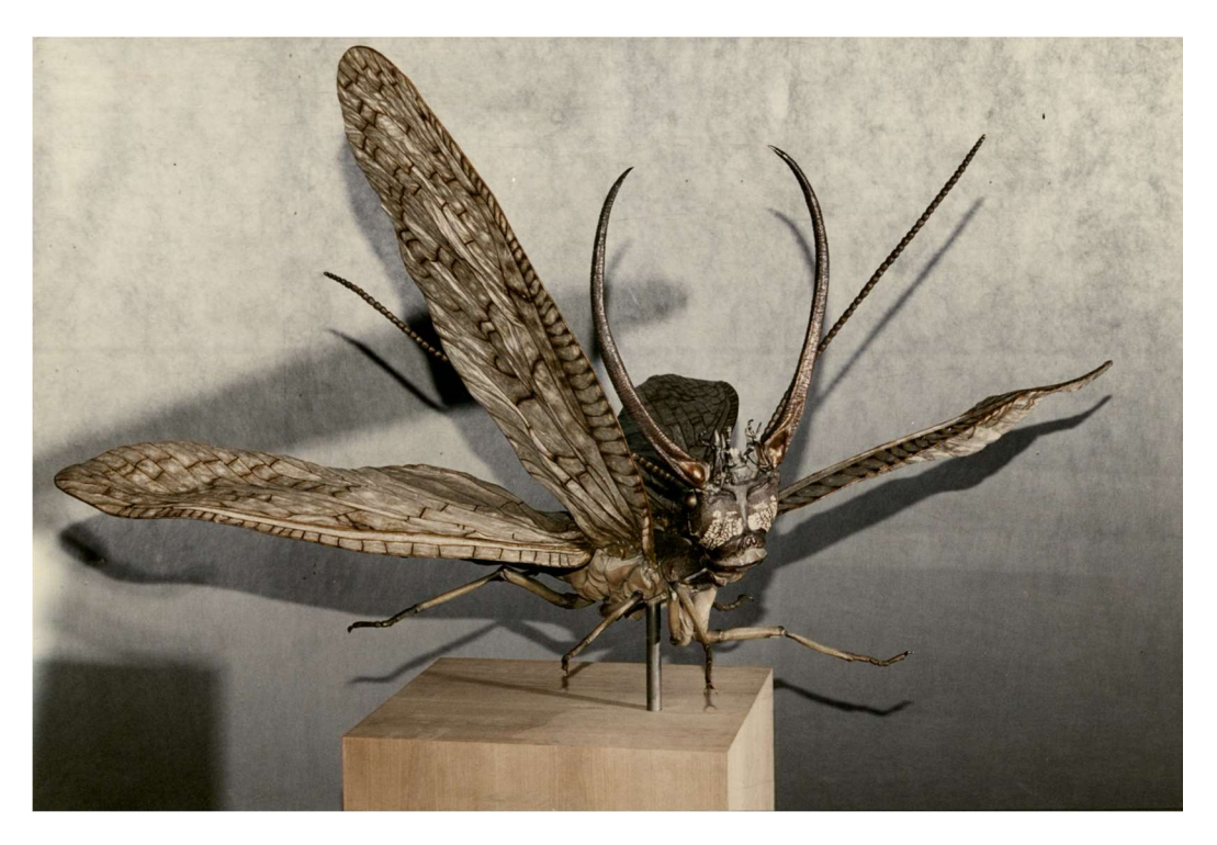
Figure 4. Bronze sculpture of adult dobsonfly, C. cornutus (L.), exhibited at the Fairbanks Museum and Planetarium in Vermont, United States (artist Adam Pasamanick, dimensions 1.82 m high \times 1.52 m wide \times 1.21 m long).

tranquilizer in Japan [33]. Energy flow from the aquatic towards the terrestrial environment, based on considerable figures of secondary production by megalopteran larvae [55,56], is another understudied service of this biological group in neighboring freshwater and terrestrial ecosystems. At least one artist (Adam Pasamanick) has built a realistic bronze sculpture of a male Corydalus cornutus , now exhibited at the Fairbanks Museum and Planetarium in Vermont (Figure 4).