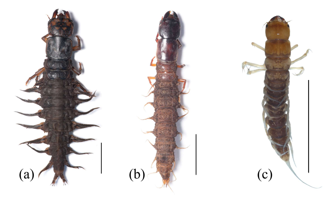
Figure 1. Habitus of Megaloptera larvae. (a) Corydalus liui Ardila-Camacho & Contreras-Ramos, 2018, (b) Chloronia sp., (c) Ilyobius sp. Scale = 10 mm.

and Chauliodinae van der Weele, 1909 (fishflies). All species of Megaloptera have aquatic larvae, whereas eggs, pupae, and adults of all species are terrestrial (Figure 2). Megaloptera are considered one of the ancient groups within holometabolous insects [8,9].