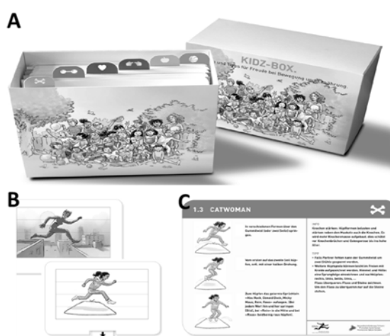
Figure 2. The KIDZ-Box ® exercise toolbox including 20 exercise cards (A), with illustrative exercise description (B) and explanations and task variations (C), respectively.

The children of the INT were instructed to train for agility, balance, endurance and jump performance using the KIDZ-Box ® at the preschool. This teaching material was specifically developed for preschoolers based on typical preschool movement patterns by the Department of Sport, Exercise and Health of the University of Basel (Basel, Switzerland) in cooperation with Health Promotion Switzerland and consisted of different cards providing 20 task and information cards for cardiac function (3 cards: running), strength (3 cards), dexterity (7 cards), playing (4 cards), nutrition (4 cards), bone health (3 cards) (Figure 2, for more information see: http://gesundheitsfoerderung.ch/bevoelkerung/produkte-und-dienstleistungen/ernaehrung-und-bewegung/kidz-box.html ). The exercises with special emphasize on jumping, muscle strength, agility and balance (dexterity) as well as endurance were used. In order to provide training progressions and to avoid underchallenges, exercise modifications were also provided for each exercise on the cards. Prior to the start of the intervention period, all preschool teachers were instructed in detail by research assistants. Within a total time frame of 7 months, the KIDZ-Box ® activity cards were employed daily for 15 min. At the end of the intervention period, all cards should have been used. Card changes and emphasizes were accomplished by the teachers.