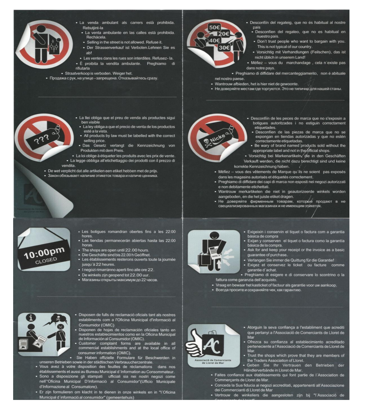
Figure 2. Flyer of the aggressive campaign against unfair competition addressed to the clientele (tourists) in eight languages. The flyers warn about the existence of unlawful activities: informal economy, street hawking, selling of fake goods, etc. , and provides some advices to fight these activities.