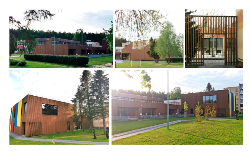
Figure 2. Kindergarten "Peledziukas" located in Vilnius, made with materials and roof configuration recalling traditional wood architecture was selected as an example of mimetic biophilic design. Photographs by A. Daugelaite.