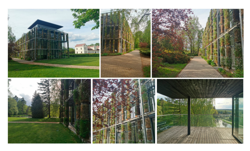
Figure 3. Vilnius University Kairenai Botanical Garden's Green Building-Plant with external layer of vegetation was selected as an example of applied biophilic design.