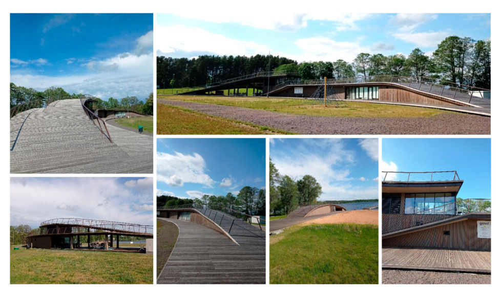
Figure 4. Recreation and Water Center in Zarasai with landscape-inspired volumes and nature-like spatial characteristics was selected as an example of organic biophilic design.