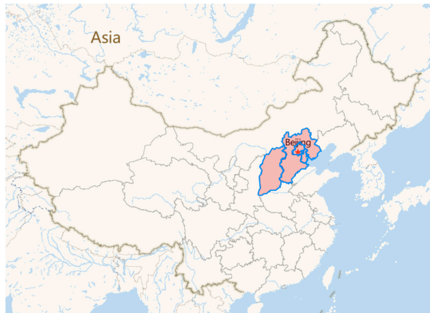
Figure 2. The map of Beijing and its adjacent regions.

Regarding lifestyle, 88.5% of respondents were not current smokers [56], and 52% considered themselves current drinkers [57]. According to a study on alcohol consumption among the Chinese population [57], current drinkers were divided into three groups: light, moderate, and heavy drinkers. Respondents who identified as light drinkers (38.8%) were the largest population in this survey. Regarding intensity of physical activity, over half of our study's respondents (68.5%) were light exercisers (e.g., walking), which was higher than the number of moderate exercisers (e.g., yoga, tai chi; 17.4%) and the number of vigorous exercisers (e.g., running, table tennis; 3.7%) [58].