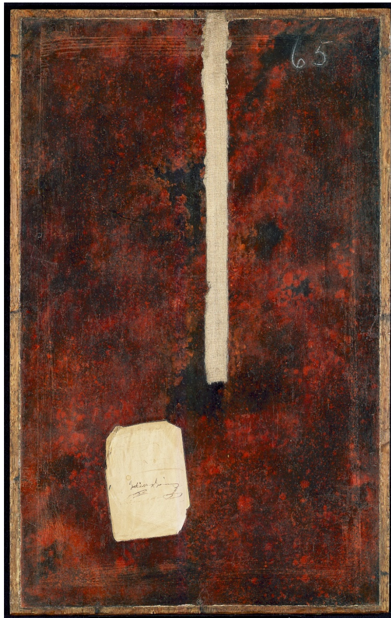
Figure 4. Rogier van der Weyden, Reverse of the Crucifixion , oil on panel, 79.30 × 49.90 cm, Berlin, Gemäldegalerie (inv. No. 538A): bpk/Gemäldegalerie, SMB/Volker-H. Schneider (Accessed on: 15 October 2021).

The topic of the crucifixion focused primarily on the body of Christ. The death of the body and the exposure of flesh and blood initiated thereby emphasizes the climax of the incarnation of the divine Son and therefore a climax of the manhood and carnality of his body. The moment of the death of the human shell could therefore be understood as a turning point in which the human returns to the purely divine nature.