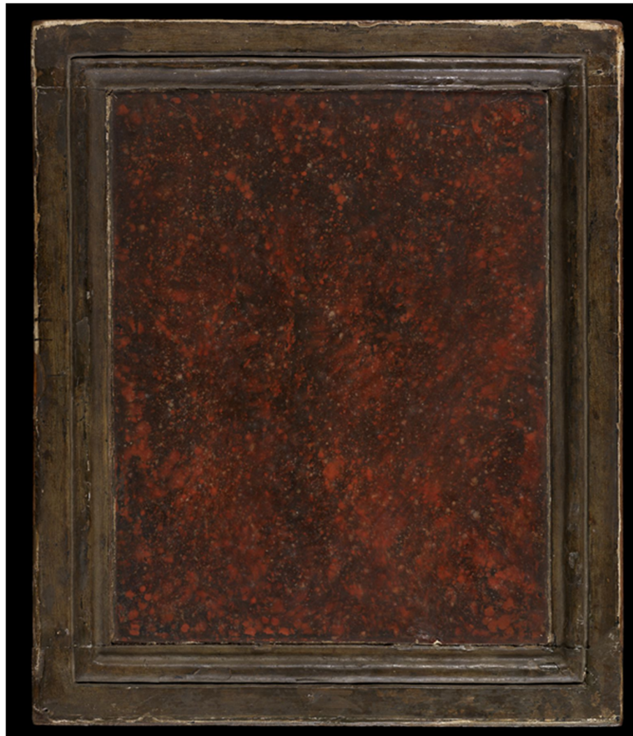
Figure 2. Jan van Eyck, Reverse of the Portrait of Margareta van Eyck , protein-based medium on panel, 32.6 × 25.8 cm, Bruges, Groeningemuseum, (inv. No. 000GRO0162.1): Musea Brugge— www.artinflanders.be —Hugo Maertens (Accessed on: 15 October 2021).

For this effect of transparency, actual marble has been discussed as an extraordinary material in the past. For example, Bissera V. Pentcheva was able to reconstruct the early Christian tradition of perception of marble surfaces in the sixth-century interior of the church of Hagia Sophia. 14 She suggests that the effect of marbled surfaces evokes an image of liquification through shimmering due to the influence of light and shadow. 15 These imaginative transformations of the material are triggered by its light-absorbing and light-reflecting properties. On a theological level, they were presumably taken as a spiritual presence in the material (Cf. Pentcheva 2011 , pp. 97–101). Marble thus made representable what was not representable, a transformation of substance and form. The reason for van Eyck's exceptionally careful layering technique on the reverse may be related to such a perceptual tradition with respect to marble. In particular, the transparent intermediate layers he placed under and over the colour splashes were probably intended to provide a greater surface for the influence of light and shadow and their associated effects.