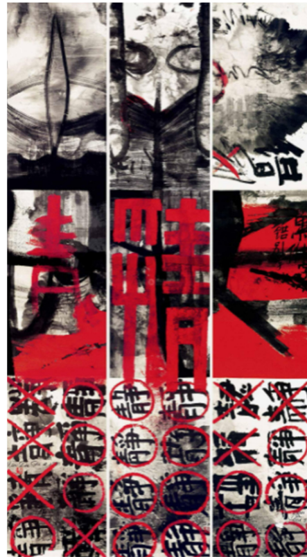
Figure 1. “Drama of the Hybridization of Two Cultural Forms” by Wenda Gu. Ink on paper and white-silk-framed vertical shaft. First published in Fine Arts , 1986, vol. 1.

points of resistance in the study of western art. However, when western art theory and practice entered China again after the end of the 1970s, its reception was more critical due to the history of ideological criticism it had received under the long-term influence of the socialist political culture. In the efforts to construct modern Chinese culture, the question of how to deal with this mixed theoretical framework became a collective challenge in the 1980s. The tension brought about by these internal and external influences in the 1980s erupted into a nationwide “Cultural Discussion” between 1984 and 1985. Within this wider discussion, artists expressed their different positions through their art practices, forming the vigorous ‘85 New Wave Art Movement’.