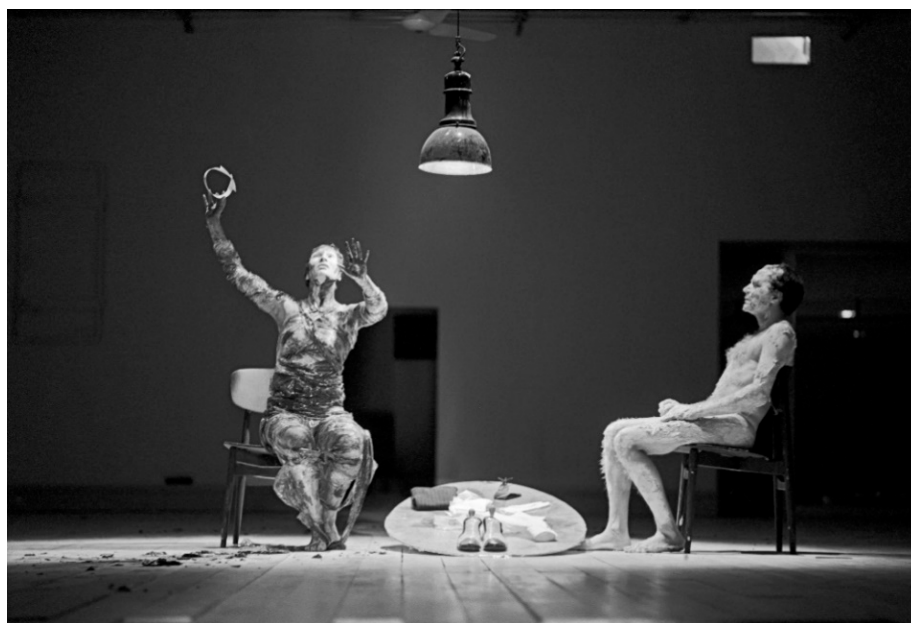
Figure 4. Agave in a bloody costume made of bandages, sitting with Cadmus, his body covered with plaster, in Die Bakchen directed by Klaus Michael Grüber for the Berlin Schaubühne, 1974. Deutsches Theatermuseum München

through the two performances: that language does not equal communication and seeing does not amount to knowing.