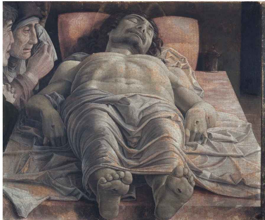
Figure 2. Andrea Mantegna, Lamentation of Christ (c. 1480), Pinacoteca di Brera, Milan.

suggest Jannis Kounellis' Arte Povera piece, Twelve Live Horses (Untitled) , presented also in 1969, at the Galleria L' Attico in Rome, where the horses stood for several days. 5