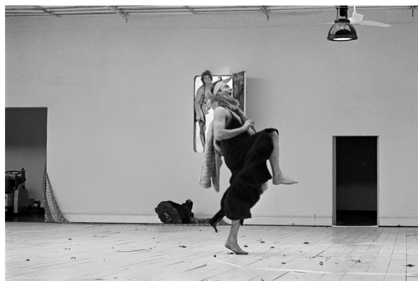
Figure 3. Pentheus taking some exaggerated dancing poses, just like the ones depicted in the Pronomos Krater, in Die Bakchen directed by Klaus Michael Grüber for the Berlin Schaubühne, 1974. Deutsches Theatermuseum München