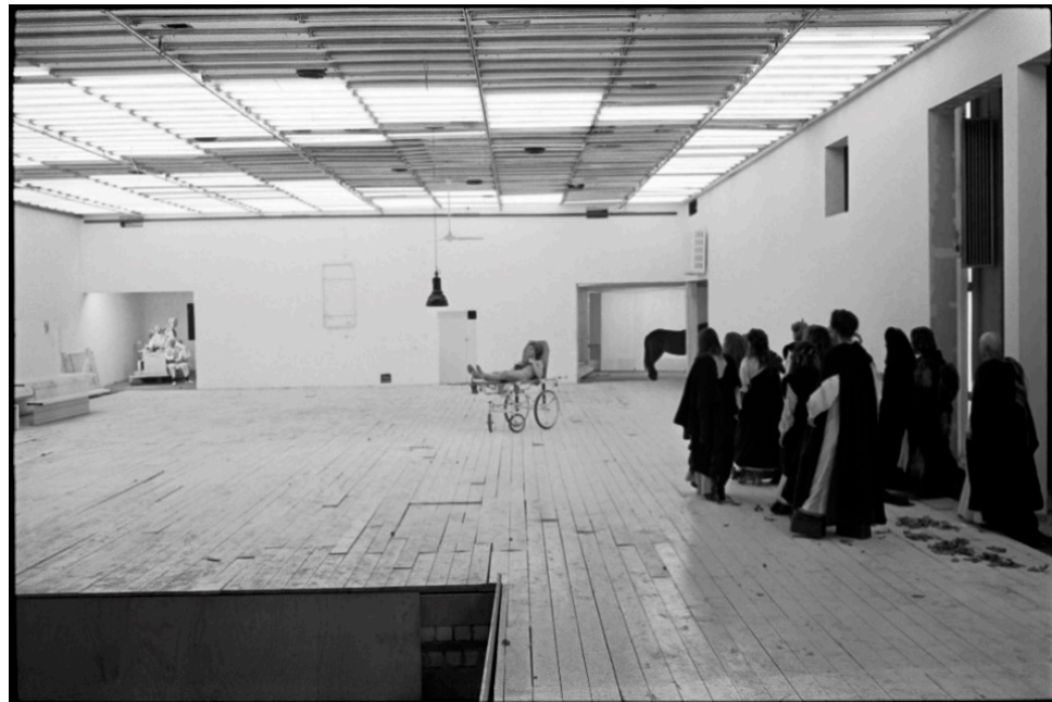
Figure 6. The Die Bakchen set, designed by Gilles Aillaud and Eduardo Arroyo, resembled a ‘white cube’ exhibition space. Deutsches Theatermuseum München

Funding: This research is co-financed by Greece and the European Union (European Social Fund-ESF) through the Operational Programme “Human Resources Development, Education and Lifelong Learning” in the context of the project “Reinforcement of Postdoctoral Researchers—2nd Cycle” (MIS-5033021), implemented by the State Scholarships Foundation (IKY).