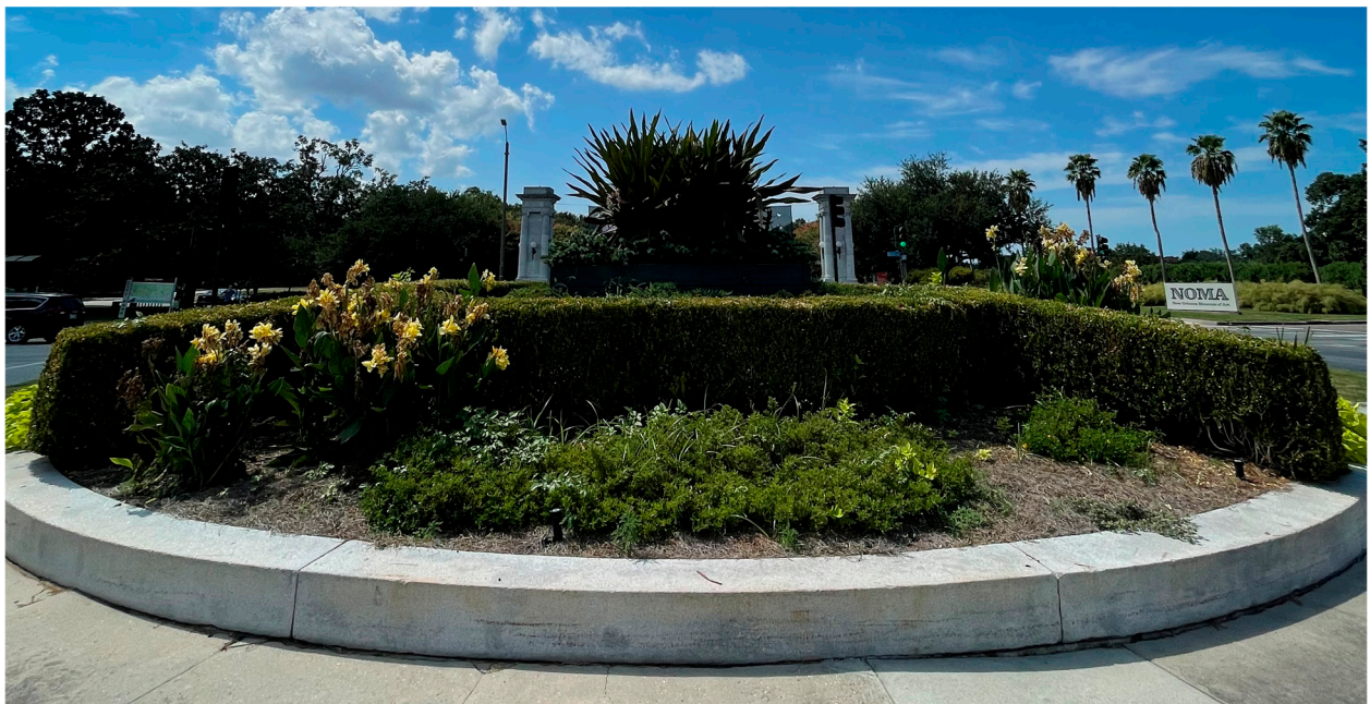
Figure 5. The site of the Beauregard Monument after removal of the pedestal, 2023.

The pedestal that once held up Beauregard, Aziz, and Wilson was dismantled in August 2021. All that remains of it now is the traffic circle that serves as the visitor's entrance into City Park and the New Orleans Museum of Art. Inside of a wooden planter bed the size and dimensions of the pedestal, rising above a hedgerow, a grouping of giant crinum lillies serve as the monument's grave marker (Figure 5). There is nothing particularly affective about the landscaping of a traffic circle, but there is something affecting about what it promises: roots anchored in a problematic space offer the promise of growth, beauty, and new forms of commemoration.