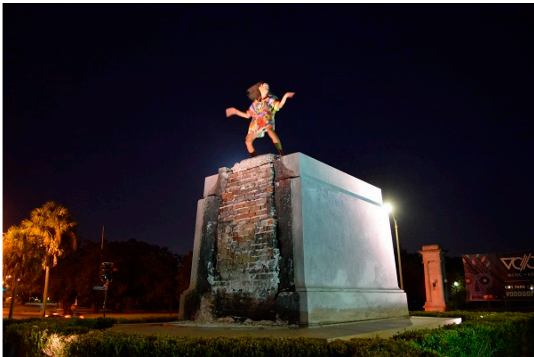
Figure 2. Paula Wilson. Living Monument . 2017.