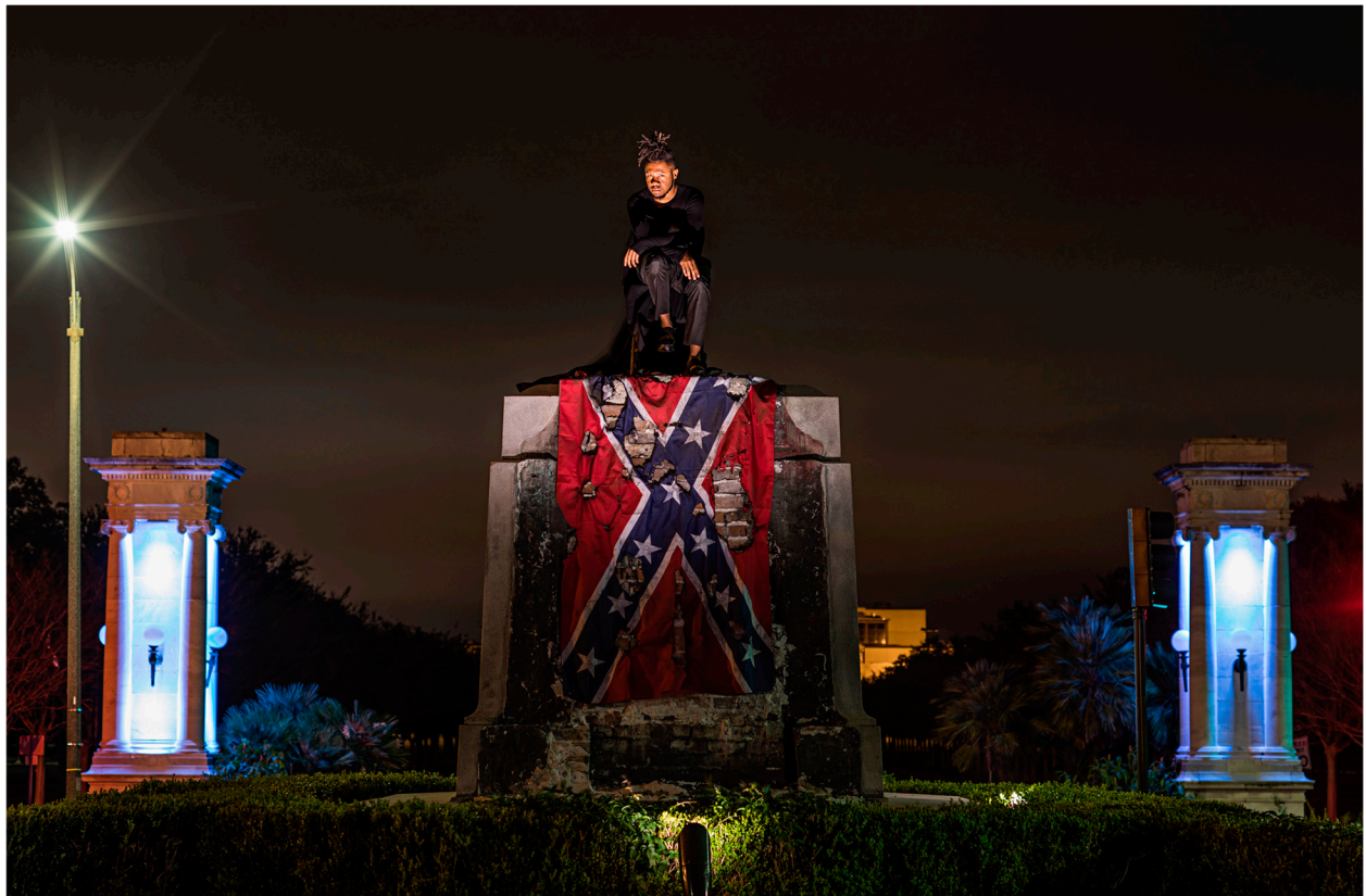
Figure 4. Nic[o] Brierre Aziz in collaboration with Ti-Rock Moore. New Wars. New Stories. New Heroes. 2017. Editioned print of time-based performance on plinth of former P.G.T. Beauregard Equestrian statue in New Orleans, LA.