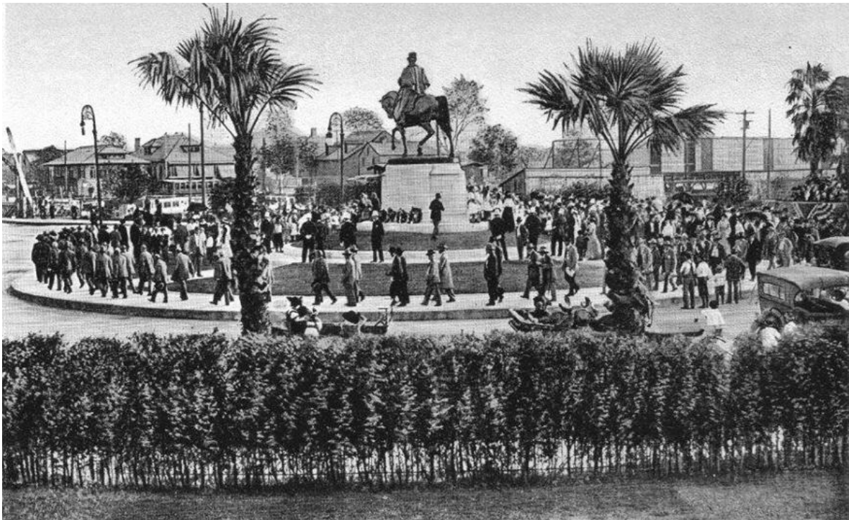
Figure 1. Photograph showing the dedication of the Beauregard Monument, published on the front page of The Times-Picayune , 12 November 1915.

in stone, sculpted by the same man who crafted the effigy of Lee, would continue to exalt and honor the Lost Cause that he fought for.