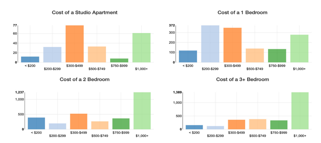
Figure 1. Quantity and cost of various types of units in 02121 (unitedstateszipcodes.org (accessed on 18 April 2023)).