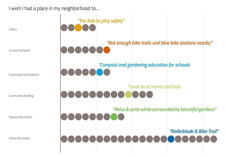
Figure 6. Boston open streets data for DoT Greenway, [REDACTED], 2023.