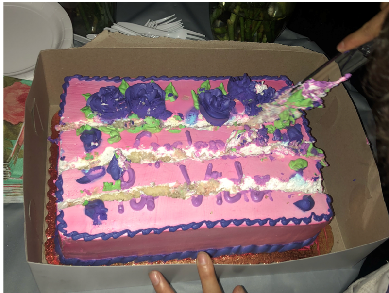
Figure 6. Cutting into the Cyclona cake as part of Escandalos Angeles , Club Chico, Montebello, California, 13 July 2018.