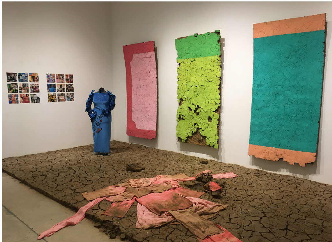
Figure 1. Exhibition view, rafa esparza: de la Calle , Institute of Contemporary Art, Los Angeles, 15 June 2018, photo by the author.

circuits. As an exhibition, de la Calle is just one of a recent suite of gallery, museum, and public art projects since 2014 where esparza presented work in dialogue with others, and the exhibition gestured to the notion of him as a member of an artistic community whose practices come from, and perhaps make most sense outside of, something other than the mainstream art world. 1 While de la Calle did not mark this outright, nor did the exhibition's didactics historicize the artists' practices within a legacy of art, performance, or nightlife in the city, esparza and his collaborators nevertheless created a group of artworks that spoke to these myriad of influences and left the door open for how we might begin to consider, or reconsider, our understanding of their work. 2