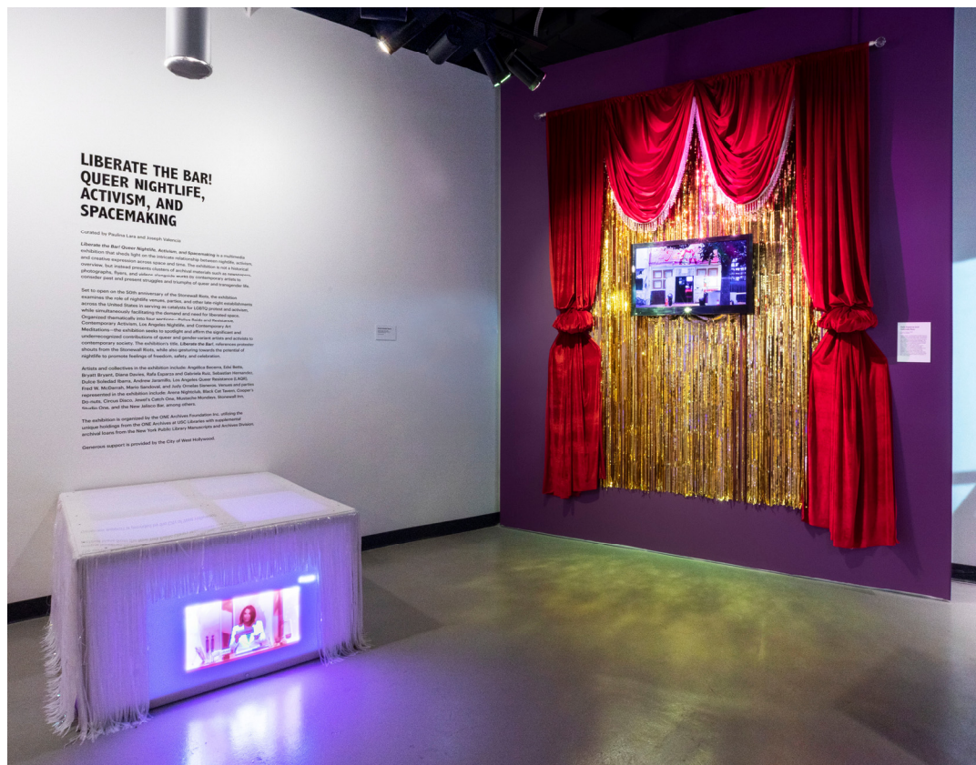
Figure 2. Exhibition view, Liberate the Bar! Queer Nightlife, Activism, and Spacemaking , on view at ONE Gallery, West Hollywood, 28 June 2019–20 October 2019, photo by Monica Orozco. esparza and Ruiz’s art installation, right, replicates elements of the New Jalisco Bar’s interior and showcases the duo’s mural within the embedded TV monitor. The work on the left is by Dulce Soledad Ibarra.