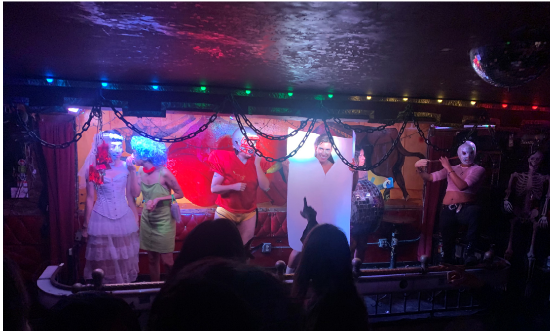
Figure 8. Costume finalists take the stage at YOU , La Cita Bar, Los Angeles, 16 October 2019, photo by the author.

and found community in the weekly party, offered early support of YOU and served as DJs, performers, hosts, event staff, and social media support.