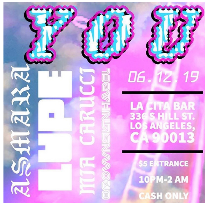
Figure 9. YOU digital flyer, 12 June 2019, design by Sebastian Hernandez.

making, as a process, does not suggest the creation of a geopolitical or bordered culture but rather the production of a moment or space of “creative, expressive, and transformative possibilities” (Buckland 2002, p. 4). As a queer nightlife organizer, Hernandez taps into this world-making apparatus to develop art and performances and build communality, visibility, and a sense of self, while spring-boarding into other underground and mainstream art, design, and performance settings and opportunities. 34