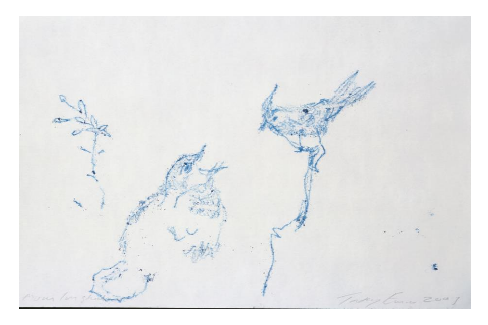
Figure 6. Tracey Emin, Mum I'm Stuck, 2001, one of 14 monoprints of the Bird Drawing series (14 framed monoprints, dimensions variable). © The artist. Courtesy of White Cube. Photo by Stephen White.