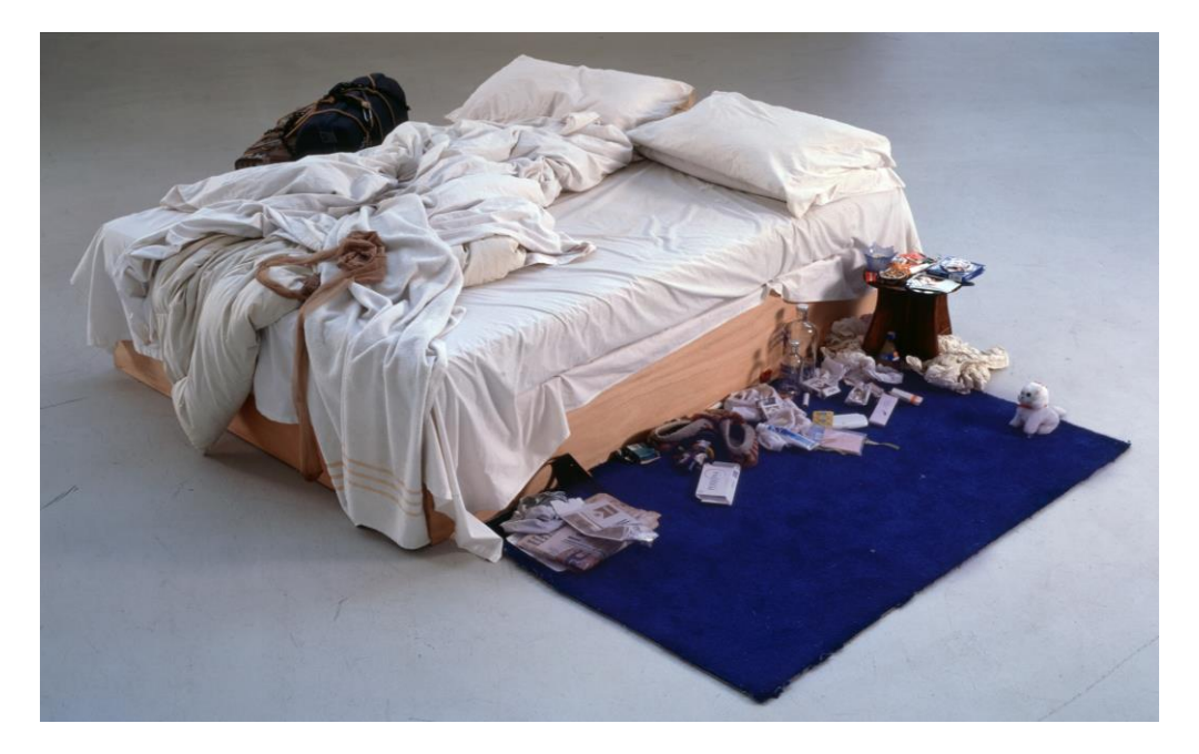
Figure 4. Tracey Emin, My Bed, 1998, mixed media (79 cm \times 211 cm \times 234 cm). © The artist. Courtesy of The Saatchi Gallery, London. Photo Prudence Cuming Associates Ltd.

Time and again, this act of creation will is repeated in Emin's artist work, an act through which those objects by her gathered/selected as meta-references to biographic events are raised to the category of artistic. This happens with a tooth, a dentist card, and a passport in My Future (1993–1994). This happens with a newspaper sheet and a wrinkled cigarette pack in Uncle Colin (1963–1993). In a different way, this also happens in her colection My Major Retrospective (1982–1992) consisting of small framed photographic reproductions of her previous artistic work, disappeared in two destructive acts commented on later.