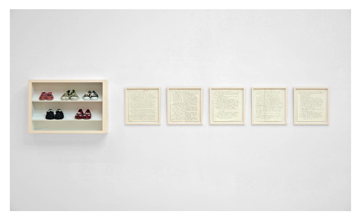
Figure 5. Tracey Emin, Feeling Pregnant II 1999–2002, mixed media (vitrine: 49.7 \text{ cm} \times 56.7 \text{ cm} \times 17 \text{ cm} ; framed texts: 35 \text{ cm} \times 26.3 \text{ cm} ).

Throughout the whole artistic work of Tracey Emin appears, time and again, the so-called meta-topic of art at the end of the millenium: the body. In the case of Emin, her own body. In fact, Emin's body as an organic expression of her own vital reality is present -either explicitly or implicitlyin all her artistic production, as all her art refers to herself. Her body, many times naked, is the explicit subject for many of her Polaroid snapshots. Her body is also the protagonist in Outside Myself (1994), the series, Naked Photos: Life Model goes Mad (1996), I've Got it All (2000), Sometimes... (2001), and The Last Thing I Said to You is Don't Leave Me Here I (2000). The photograph, I've Got it All , is one of the most commented artistic pieces of Emin [1,2,4,11,12,16,30], and has been considered one of her most problematic works due to its remarkable ambiguity [12]. In this photo, Emin appears sitting on the floor, bare legged, legs apart, her face gazing her hands that are clutching cash -both coins and notes- around the area of her vagina.