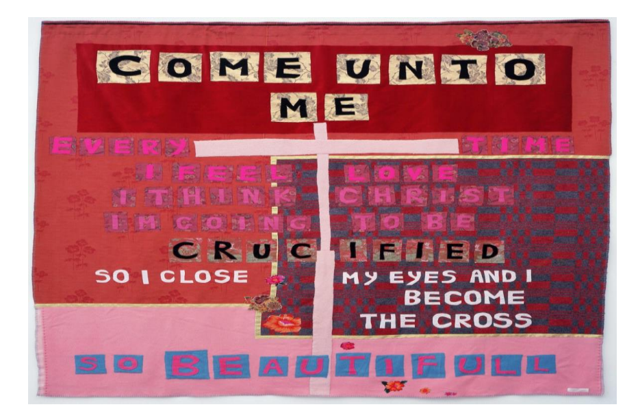
Figure 7. Tracey Emin, Automatic Orgasm (Come Unto Me), 2001, appliquéd blanket (263 cm \times 214 cm).

Emin makes use of fabric in the form of applications (trimmed pieces sewn on another support) very frequently. In her first exhibition, Emin showed a small piece made by herself at the age of seven with embroidering and remnants, entitled My Elephant . Currently, her blankets with applications are part of her most popular works. On the other hand, these blankets are the most showy examples of her obsessions and fears made art. This is the case of Automatic Orgasm (Come Unto Me) (2001), see Figure 7, and Star Trek Voyager (2007), among many others.