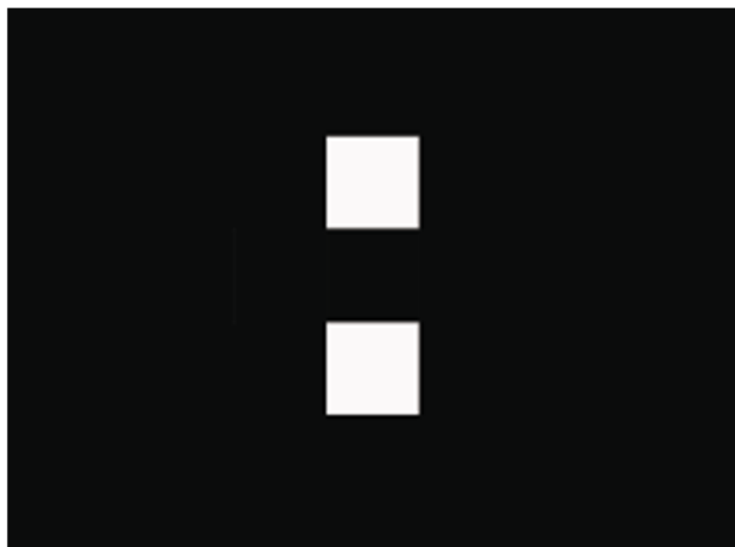
Figure 4. Ernest Edmonds, still from Fragment (1964–65).

The algorithmic system that generates a work such as Fragment is, of course, a closed system. That is to say, the system is entirely self-contained and has no exchange with any other system, that is, it has no exchange with the outside world. Many artists add calls to random number generators—technically pseudo random numbers ( Strawderman 1965 )—into their algorithms so that the resulting works are unpredictable and/or are different each time the algorithm is run. The motives vary, but include the idea of simulating ‘creative’ interventions and simulating interchange with a world outside the algorithm ( Baggie 2008 ). I use another approach. After making the series of works starting with Fragment , I began to make works where the algorithmic system was open, where the system had exchanges with its environment taking readings from sensors, for example, and