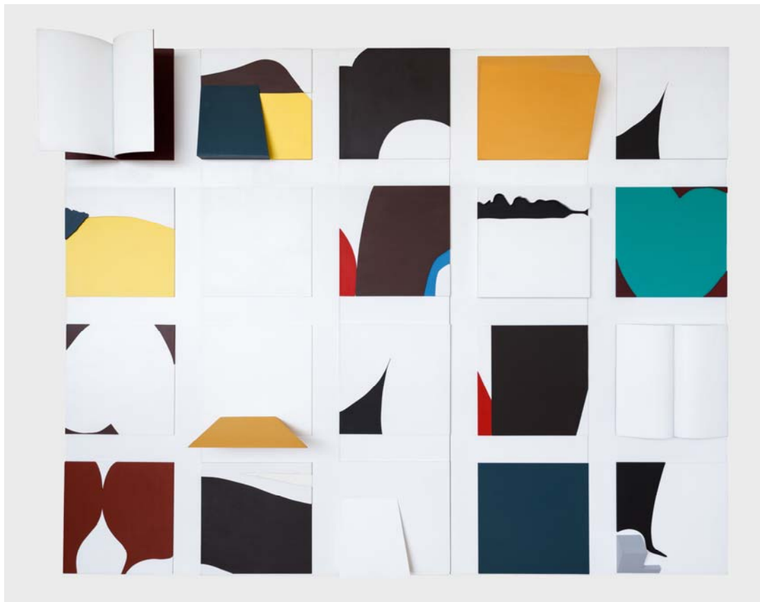
Figure 1. Ernest Edmonds, Nineteen (1968–69).