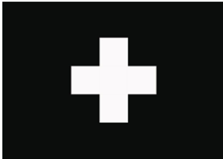
Figure 3. Ernest Edmonds, still from Fragment (1964–65).

implemented within the computer. Time was a concrete part of the constructed work. In Fragment , and other work done at that time, both the images and the timing are determined by the generative rules as the computer system works through them. The totality of the work, with the exception of its physical manifestation, is therefore completely implicit in the defining rules. For a discussion of the construction of these works see ( Edmonds 1988 ).