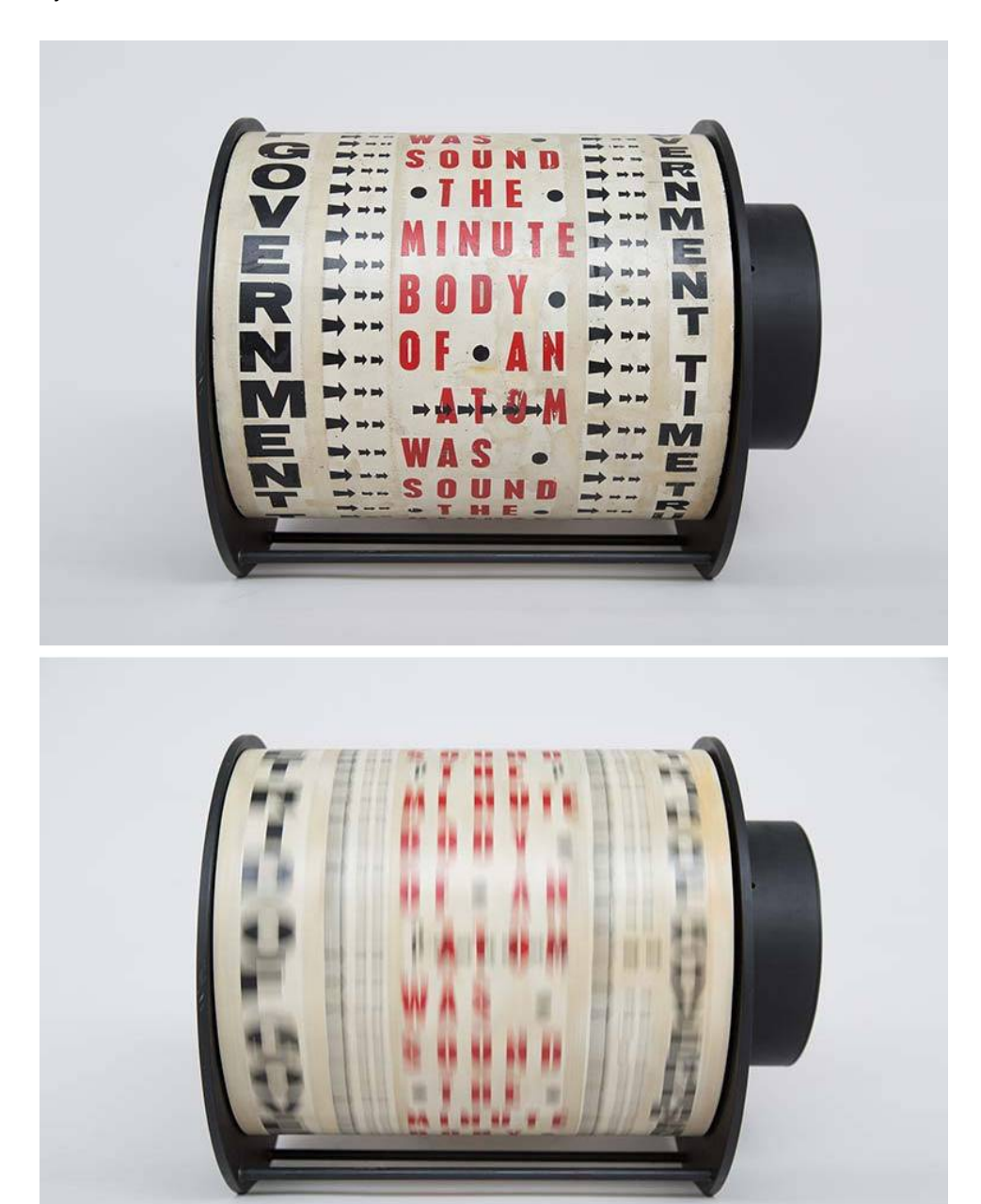
Figure 1. Get Rid of Government Time by Liliane Lijn, 1962; frame modified in 1965. Letraset on painted metal drum, plastic, painted metal, motor, 29.5 cm \times 38 cm \times 30 cm. Words from a poem by Nazli Nour. Collection of Stephen Weiss.

artists. I wasn't particularly drawn to their use by what I saw; that is, kinesis for and in itself did not particularly excite me.