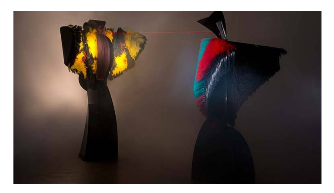
Figure 3. Conjunction of Opposites: Lady of the Wild Things and Woman of War by Liliane Lijn, 1983–86. Mixed media, 400 \text{ cm} \times 800 \text{ cm} \times 400 \text{ cm} . Photo used by permission.

There are further surprises, a sense of unpredictability that, combined with complexity, transforms the machine into something more organic. In making these larger-than-life figures, I wanted to combine animal, plant, mineral, and machine, drawing together our mythic past with an imagined future.