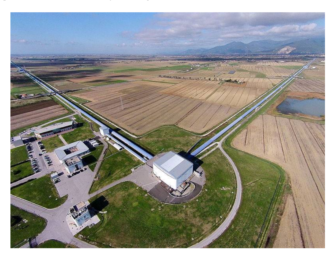
Figure 4. Aerial view of the Virgo European Gravity Observatory near Pisa, Italy.

In order to detect a minute deformation of space-time, on the order of 10^{-18} m, that was generated by two colliding black holes nearly 1.3 billion light years away, scientists must use larger and larger arrays of machines and instruments. On my recent visit to the Virgo European Gravitational Observatory in Pisa (Figure 4), the sight of these extraordinary machines, these tools that men and women have made collaboratively to see far into space-time, made me feel that perhaps artists could also pool their individual creativity and imagination to visualize an infinite inner universe.