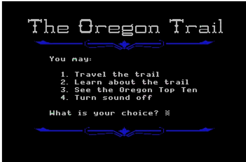
Figure 1. This screen capture from The Oregon Trail shows the game's simple interface.

cover the required subjects, but to also provide character education and reflection on moral values; Mantle-Bromley and Foster (2005) argue that language arts teachers are uniquely positioned to provide education on matters of democracy and social justice because of the importance of literacy and storytelling in building an understanding of the broader world.