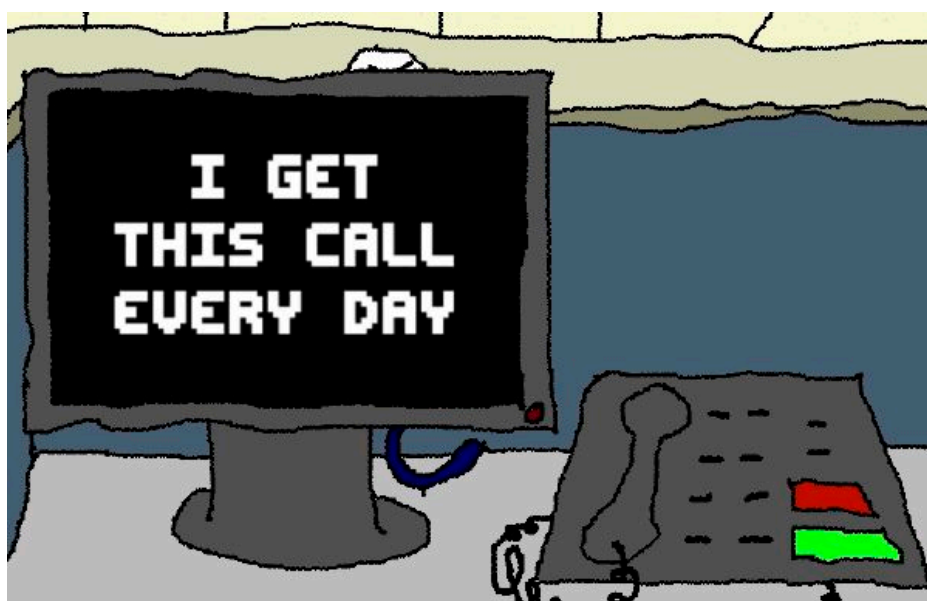
Figure 2. The opening screen for I Get This Call Every Day places the player in a first-person perspective at a call desk.

Depression Quest , like many games that explore lived human experiences, is focused on a particular hardship. In it, the player assumes the role of a depressed twentysomething. The game offers players frustration, recognition, and reassurance. If the player makes choices that help the character to improve their life, more pleasant options and scenarios emerge. If the players' choices result in the character's options becoming more limited, those unavailable options will be shown struck through in red (see Figure 3). The game has a soundtrack of faint atmospheric music in a minor key. As the character becomes more depressed, the images embedded in the game become more and more obscured by static; if the character becomes less depressed, the images grow clearer. Through these mechanics and through stylistic and narrative choices, the game seeks to provide a bit of experiential knowledge of depression for players. When the game was released, blog posts and articles often recounted the extent to which players used the game to recognize depression in themselves or work out a path towards treatment (Klepek 2015).