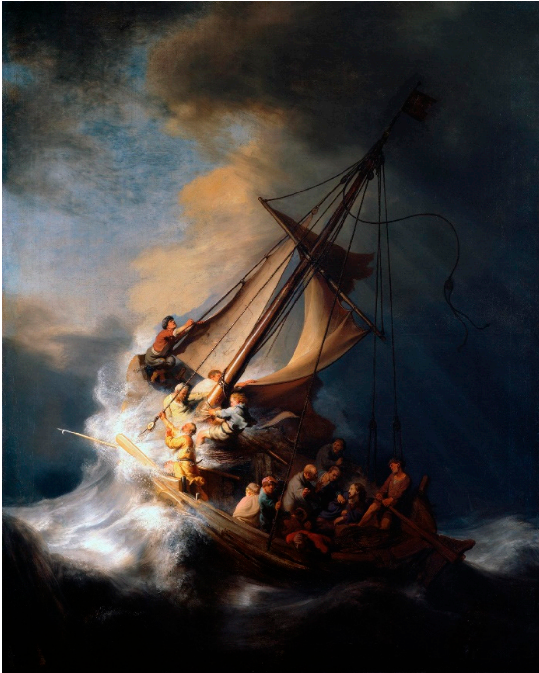
Figure 2. Rembrandt, Christ in the Storm on the Lake of Galilee , 1633, oil on canvas, Isabella Stewart Gardner Museum (stolen), artwork in the public domain.

Countries, 1572–1672 yielded a number of studies that highlighted the interconnectedness of painting in the Dutch Republic and the Habsburg Netherlands from various perspectives.