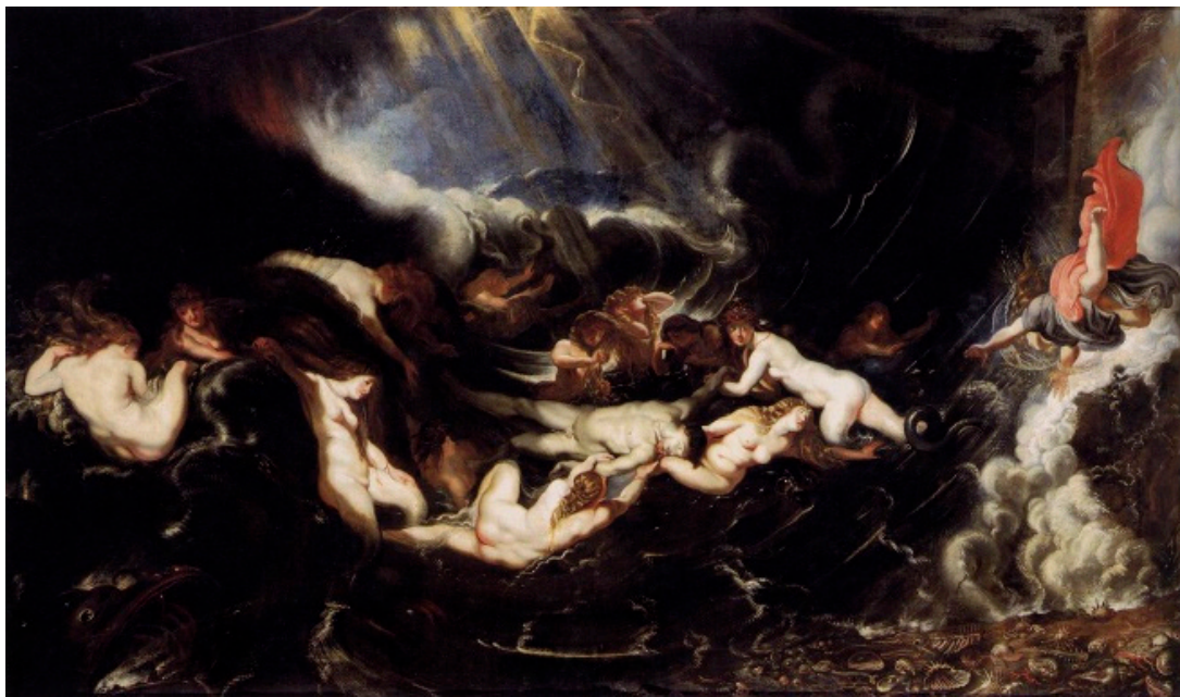
Figure 1. Peter Paul Rubens, Hero and Leander , ca. 1608, oil on canvas, Gemäldegalerie Dresden), artwork in the public domain.