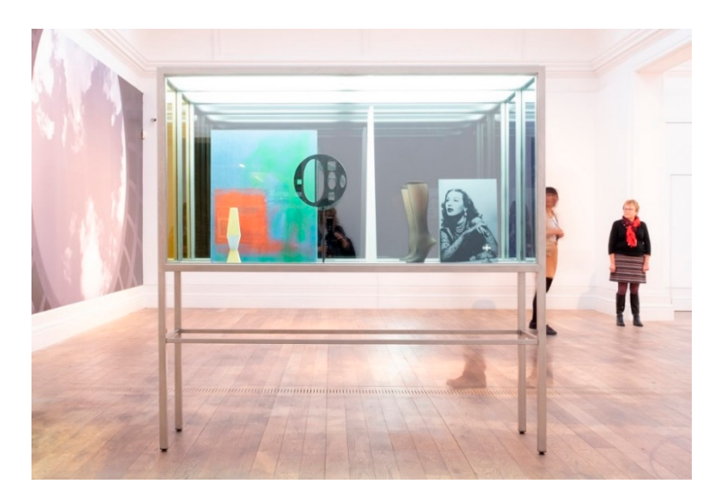
Figure 1. Josephine Meckseper. The Story of Mankind, 2014 (Installation). Mixed media in stainless steel and glass vitrine with fluorescent light and acrylic sheeting.

Meckseper's work (e.g., Figure 1) combines paintings and found objects with her own images and film footage of political protest movements. Her installations and vitrines 'by simultaneously exposing and encasing common signifiers, such as advertisements and everyday objects, next to abstract paintings and sculptures create a window into the collective unconscious of our time.' (Cramerotti 2018). She uses digital media as a tool of production, exhibition and for her films, distribution, to rearrange and interrupt the contextual settings we associate with her found objects and images.