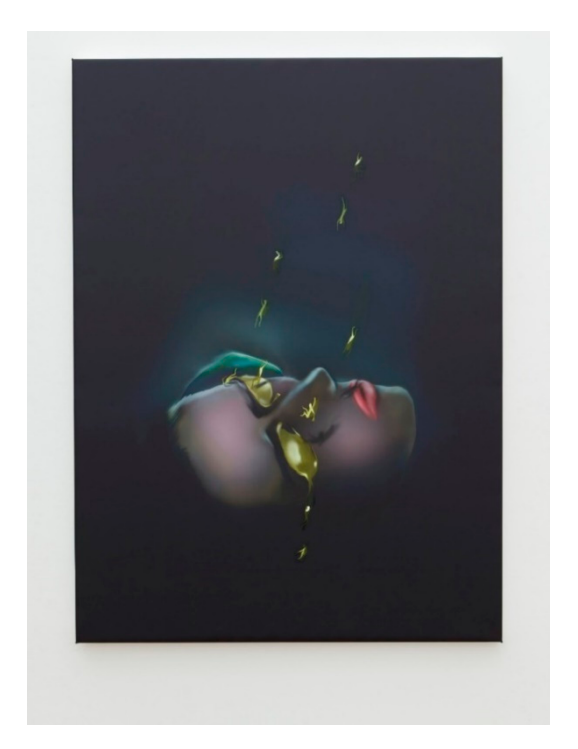
Figure 2. Louisa Gagliardi. Under the Weather, 2087. Gel medium, ink on PVC.

Historically, and in common with many contemporary art galleries, MOSTYN has preferred to keep wall-based interpretation materials to a minimum. Digital media may require more contextual referencing for audiences, but MOSTYN is also considering whether an audience attracted by digital media would be happy to use more digital interpretation tools.