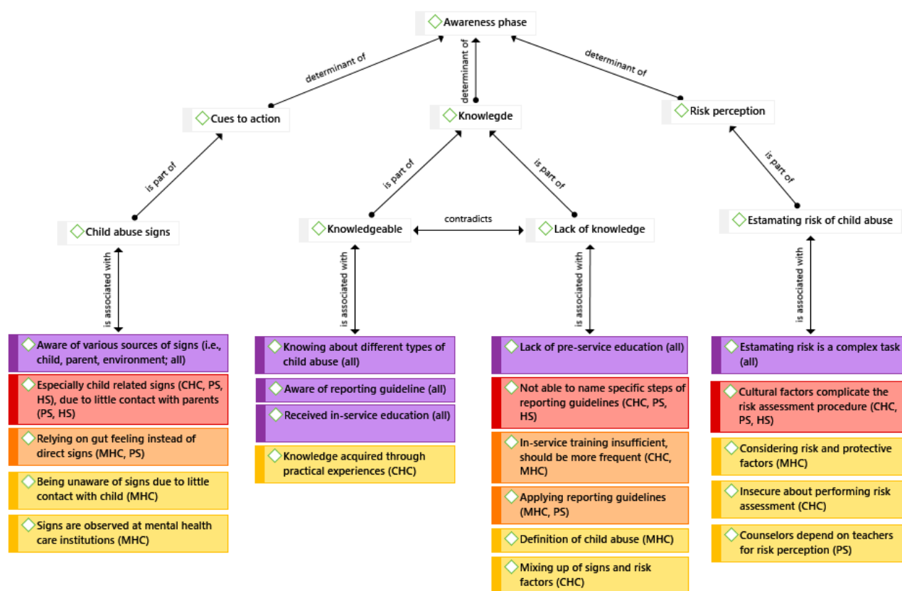
Figure 1. A concept map of the results as related to the awareness phase of the I-Change model. The labels on the second level refer to the determinants of the awareness phase, the labels on the third level refer to the key themes, and the labels on the fourth level refer to the subthemes. Subthemes with purple labels are relevant for all groups of professionals, subthemes with red labels are relevant for three groups, subthemes with orange labels for two groups, and subthemes with yellow subtheme for one group of professionals. The specific groups of professionals for which the subthemes were applicable, are presented in parentheses. CHC = child health care professionals; MHC = mental health care professionals; PS = primary school professionals; HS = high school professionals.

Audio recordings were made during the interviews which were transcribed and coded using the software program ATLAS.ti version 8. Coding was performed in three stages: open coding, axial coding, and selective coding (Boeije 2009; Strauss and Corbin 2007). First, all interviews were carefully read and each relevant fragment was provided with a code (open coding). Second, all fragments of each interview were compared to identify overlapping themes (axial coding), which corresponded to the topics in the questionnaires. Finally, the themes from the axial phase were compared and connections were made between these themes in networks (selective coding). These networks provided insight into the contradictions and similarities between different codes. Based on these networks three concept maps were created, which are depicted in Figures 1–3. The I-Change model was used as a theoretical framework in identifying important themes. All interviews were coded by the first author of this study as well as by four master degree students. The first author resolved any inconsistency in coding after which the final coding was reached.