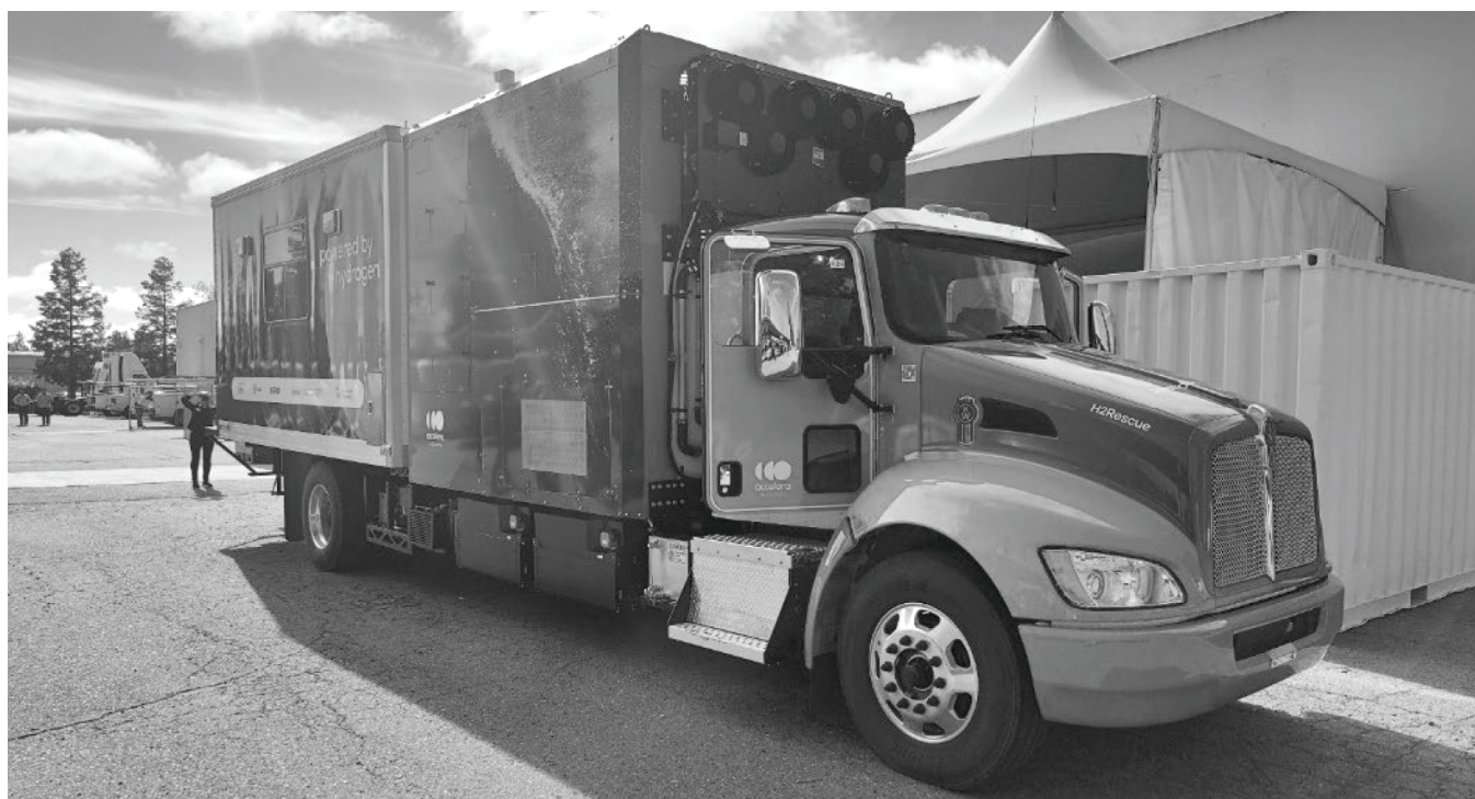
Figure 2. The H2Rescue hydrogen-powered emergency vehicle.

The second field test on 8 May started at the National Renewable Energy Laboratory in Golden, Colorado with a round-trip drive to FEMA Regional 8 in Agate, Colorado. Both 180-mile trips were completed, and the power export tests were successful, although the Colorado field test was cut short after 28.4 h due to harsh weather conditions. The functional capacity evaluation of both startup and power delivered during the export portion of the test indicated air blower limitations at higher elevations, but this did not impact regular operations.