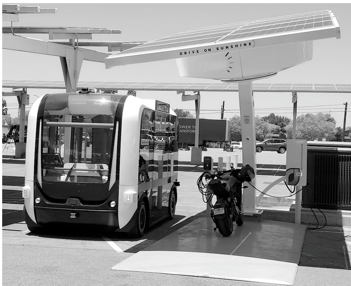
Figure 1. An off-grid, solar-powered charging station with an autonomous shuttle parked to the side and a motorcycle plugged in underneath the solar panel roof.

Although Fort Carson is proceeding with plans to transition away from light-duty vehicles (with 200 trucks currently existing on the installation; Shinn 2023 ), early efforts have only covered the Department of Public Works lighting trucks, with other departments also switching their light-duty, medium-duty, heavy-duty, and off-post vehicles at a later date. The differences between types of chargers and where they would need to be located provide a critical foundation that would lead to complete acquisition and installation. EV chargers must be mapped out by building, including how many vehicles are stationed at various parking lots. Considerations for down range and training land locations, where electrical infrastructure are lacking, opens opportunities to explore the strengths and drawbacks of standalone solar-powered charging stations (see Figure 1). R&D technology such as these off-grid chargers will mean less of a drain on current electrical infrastructure, but the location of this equipment must be carefully chosen to maximize the convenient use of alternative energy sources—an important human factor that will confirm the success of the program. Additionally, hydrogen as a clean alternative fuel complements electricity generation while also mitigating pressure on the grid (as will be shown below). Using hydrogen reduces the burden on the electric grid, generating off-peak energy to be stored and used during critical power timeframes.