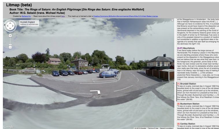
Figure 4. Screenshot of the Litmap project's website, showing a Google Street View image of the first red placemark (Brundall Station) on Barbara Hui's Litmap [33].

The landscape panorama provides a counterbalance to the overhead aerial or satellite view. It represents the territory that was abstracted by the grid map; it speaks to the desire to move through map space, to fly into it and see it up close as landmarks, streets and buildings, as the animations of Google Earth illustrate. The panorama describes the space of being, that is, a more human point of view, and in a much more precise manner than words ever can—a picture is worth a thousand words, as the old saying goes. I never really knew what a moor looked like, for instance, until I saw a photo of one, even though moors are often the settings in English novels. However, as Bruno notes, a particular sense of place is actively generated by both images and narratives, as well as emotions [31]. If the aerial view is an overhead map and the panorama describes the street level perspective, both of these remain surface mappings, representations of space that have no history or context without the third cartographic shape, that of the atlas. Patience is, in many ways, about the interrelations between the map and the tour, and the need for narrative and meaning that is made possible through the atlas view of montage and story, as the next section will explore.