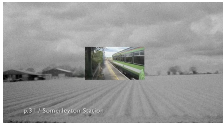
Figure 5. Screenshot from the film Patience (After Sebald) by director Grant Gee (2011), showing an assemblage of two different viewpoints.

an atlas and the editor of a film reside in their use of such elements as framing, rhythm, focus, a sense of progression, and structure.