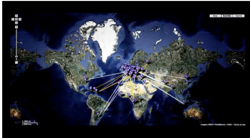
Figure 1. Screenshot from the opening sequence of the film Patience (After Sebald) by director Grant Gee (2011), showing placemarkers and connecting lines on the world map.