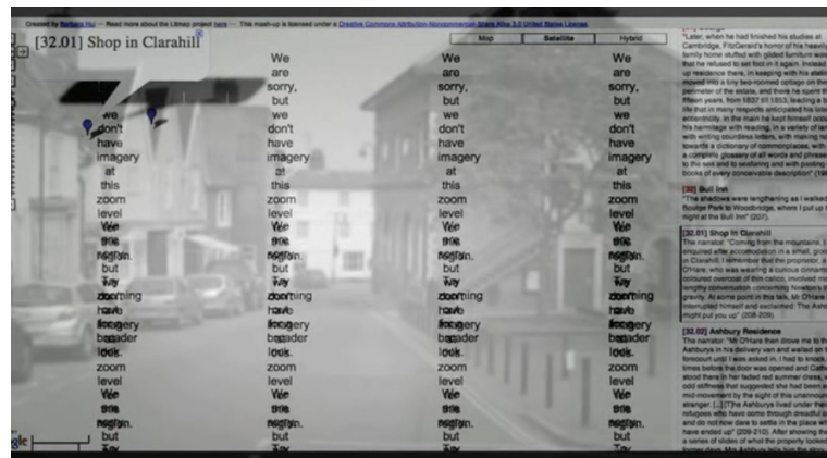
Figure 8. Screenshot from the film Patience (After Sebald) by director Grant Gee (2011), showing a Google Maps error message superimposed on cinematographic footage of a street.

to this with a sequence in the film where Hui speaks about the amazement and thrill of being able to find and visit some of the actual places in The Rings of Saturn , such as the Bull Inn or the “Shop in Clarahill”. She is showing where these places are on Google Maps, but then, as she attempts to zoom in ever closer, the map disappears into an error message that reads “We are sorry, but we don’t have imagery at this zoom level.” Superimposed behind this apology, faintly, is a cinematographic image of the place from the street level view (see Figure 8).