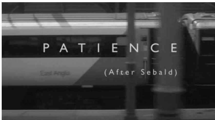
Figure 3. Screenshot from the opening credits sequence of the film Patience (After Sebald) by director Grant Gee (2011), showing the panoramic viewpoint.

From the Google Maps mashup in the opening shots of Patience , we move to a long horizontal tracking shot of an East Anglia train, which we would infer (if we are following along with book in hand) is leaving from Norwich, bound for Somerleyton Hall, Sebald’s first stop (see Figure 3). The film cuts from the satellite map of the world to the street level point of view on the train station, encapsulating the movement to the second of the three “cartographic shapes” of the film: the panorama. A beautiful black and white extended tracking shot travels the length of a train, the words “East Anglia” on the sides of the coaches, giving way to travelling shots from the train, of the tracks and the countryside.