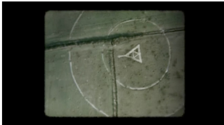
Figure 7. Screenshot from the film Patience (After Sebald) by director Grant Gee (2011), showing archival footage from the East Anglian Film Archive.

Alone, visual strategies, whether maps or panoramas, are not enough to give a full sense of place. They are tools for the mapping impulse to describe space, and to open the way for the tour, for narrative, (auto)biography and history, which deepen the picture. This next scene in the film constructs a narrative spiral, following that of the book's, to recount Sebald's chance meeting with a gardener at Somerleyton Hall. The gardener finds out Sebald is German, and tells him about the planes setting out from the 67 airfields in East Anglia to bomb Germany. Over this, we see what looks like archival footage of warplanes and bombs, projected on a screen. This is the aerial view in the original usage of the term, which, as Castro points out, was associated with war and military operations. In the film, we see aerial footage from the East Anglian Film Archive, shot from planes dropping bombs onto a large target painted in white lines on a green field (see Figure 7).