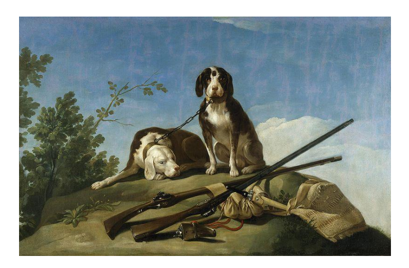
Figure 2. Francisco de Goya, Perros y útiles de caza o Perros en traílla (1775). Oil on canvas. 112 × 174 cm. Museo del Prado (Madrid, España) Public domain (Goya 1775).

With his reaction to the hunting dogs, we may reconsider Don Quixote's relation to his own galgo. At the beginning of the novel, he was introduced as a keen huntsman ("amigo de la caza") who then, by reading tales of chivalry, "almost forgot to keep up his hunting" ("olvidó casi de todo punto el ejercicio de la caza") (Cervantes 1999b, p. 13). At the start of Chapter 2, he leaves behind his previous life, including his dog and the exercise of hunting. By the end of the novel, he treats as deeply disturbing the appearance of galgos acting in the violent capacity of hunting dogs. With this personal transformation, we may discover a "critique of the hunt . . . consonant with humanists who abhor the cruelty and excess of this aristocratic pastime" (Scham 2014, p. 108).