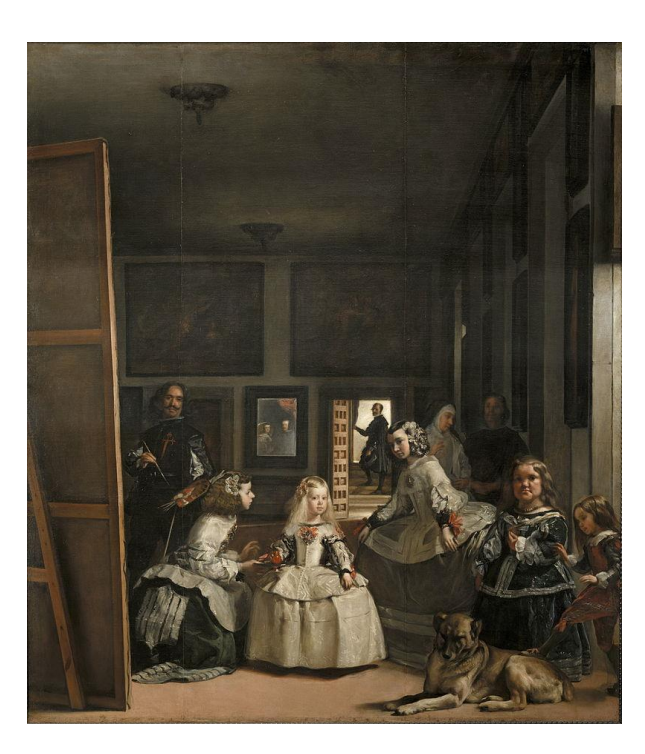
Figure 5. Diego Velázquez. Las meninas (1656), Galería online, Museo del Prado, Madrid, Spain. Public domain. (Velázquez 1656).

Lastly, I turn to "Las Meninas" (see Figure 5), the Velázquez painting so often referenced by Cervantes scholars including Gonzáles Echevarría (2015), Parr (2004), Ortuño (2012), Beusterien (2013), and others. The work, which so perfectly captures the interrelationships between creator, subject, and audience, has become a common visual entry point for grasping the logic of Don Quixote . Connolly describes "mystical ekphrasis" as "a mode of interpretation in which an image that occurs to the reader and that may have inspired the text, but for which there is no conclusive evidence, is used imaginatively to interpret the text" (Connolly 2017, p. 102). By that definition, the frequent reference to "Las Meninas," a work that chronologically could not possibly have inspired Cervantes, embodies an impossible variety of mystical ekphrasis. With animal narratology now being applied to Cervantes, "Las Meninas" has lost none of its impossibly mystical power, for there in the foreground of the painting, closest to the viewer and perfectly aligned with the corner of Velázquez's framed canvas on which he paints, we see a silent, trodden-upon figure patiently waiting with closed eyes—there, too, we find a dog.