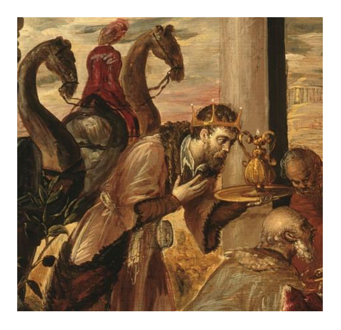
Figure 1. Detail from El Greco, Adoration of the Magi (1568), Museo Soumaya, Mexico City. Public domain (Greco 1568).

"[Cervantes] saw his scenes and the actors in them as pictures in his mind before he put them on paper, much as El Greco [see Figure 1] made little clay models of his figures before painting them." (Bell 1947, p. 101)